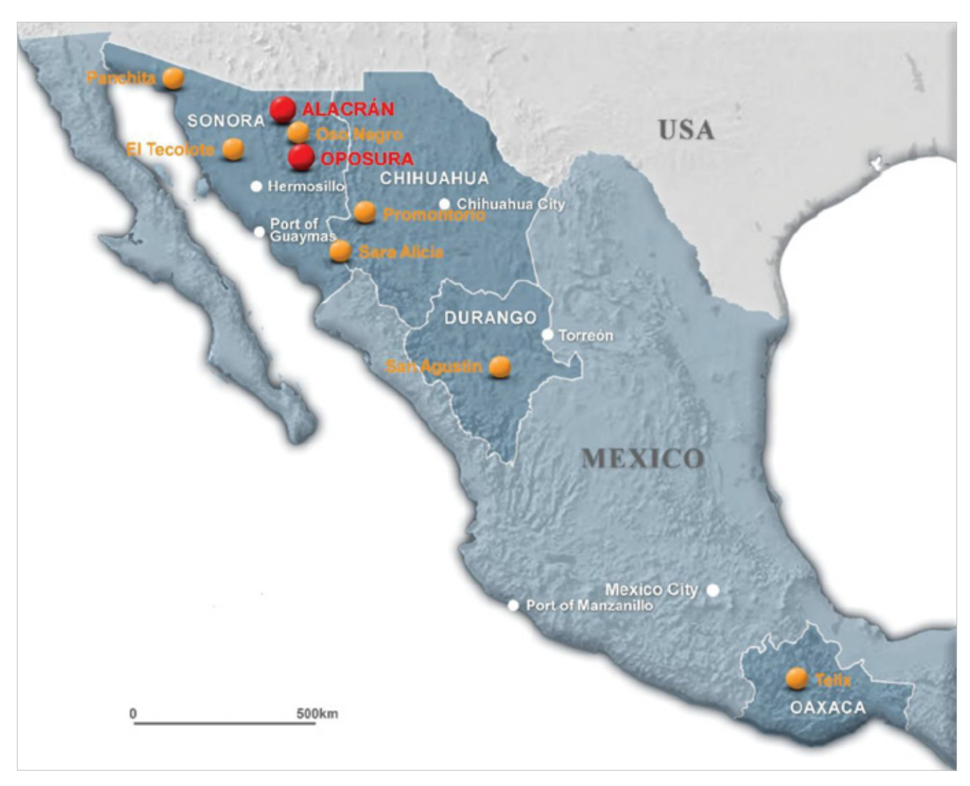
Figure 1: Plan showing locations of Azure Minerals' projects in Mexico

Importantly, Azure has regained 100% ownership and control of its very exciting Alacrán silver and gold project, following the withdrawal of its partner Teck Resources Limited. Alacrán hosts resources in excess of 32 million ounces of silver and 150,000 ounces of gold in the Mesa de Plata and Loma Bonita deposits, with very strong exploration upside for more discoveries. There will be a very strong focus on further exploration for silver and gold in the forthcoming year.