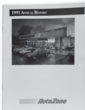
1991 Annual Report