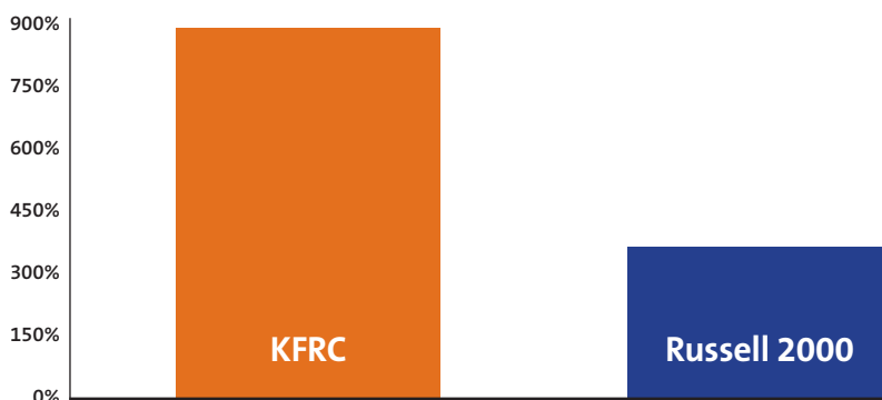
Kforce stock performance vs. Russell 2000 from 8/15/95 (IPO) to 12/31/18

The total shareholder return ("TSR") on our stock has been 892%, outperforming the Russell 2000 Index, which has returned 349% over the same period.