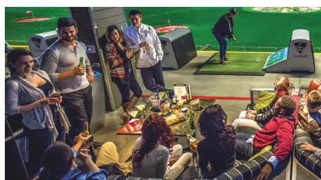
Desire to Connect & Congregate