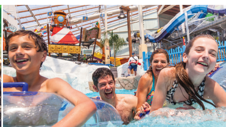
Create Memorable Experiences