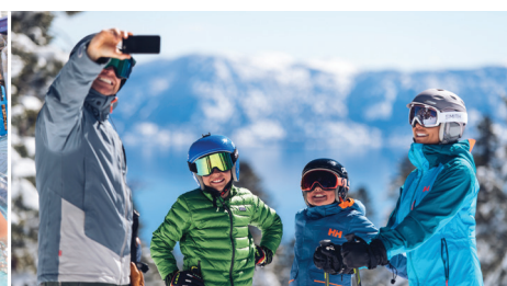
Share the Experience

As anticipated, 2022 marked a meaningful return to consumer spending in experiential activities. A number of highly anticipated movies were released, including several very successful franchise releases, driving a North American box office that topped $7.4 billion, a 65% increase from the prior year. Our portfolio of theatres is highly amenitized, highly productive and well-positioned to provide movie-goers with the out-of-home experience they seek. The increased cadence of theatrical releases also confirms studio support of theatrical distribution after several experiments around streaming.