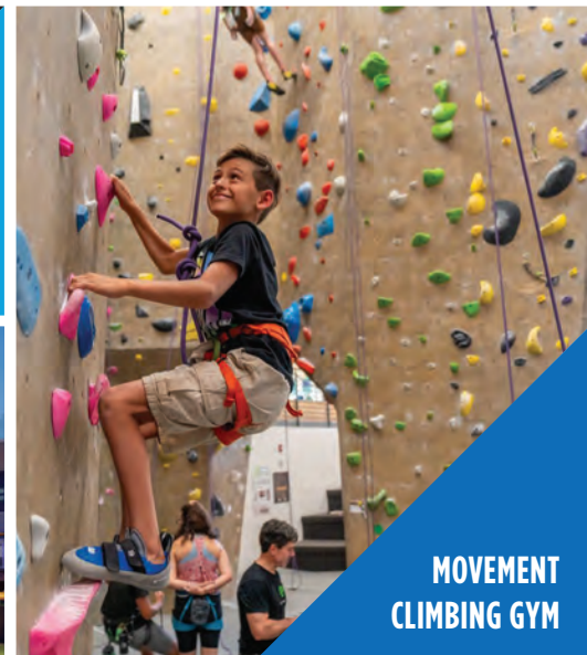
MOVEMENT CLIMBING GYM