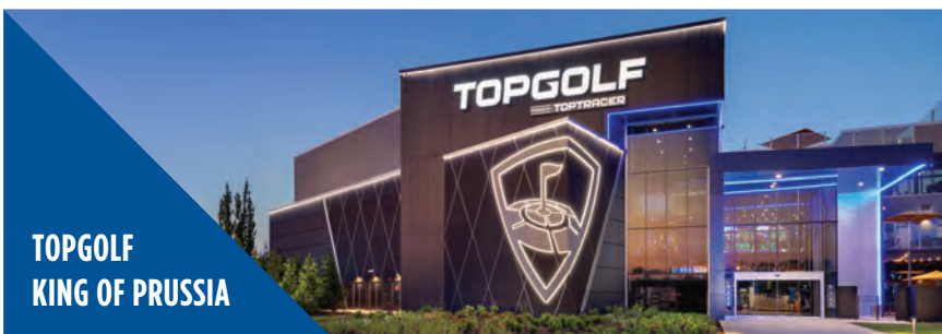
TOPGOLF KING OF PRUSSIA