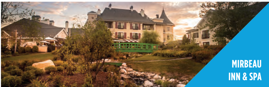
MIRBEAU INN & SPA