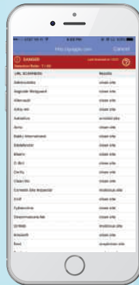
Best in Class Malicious Code Screening