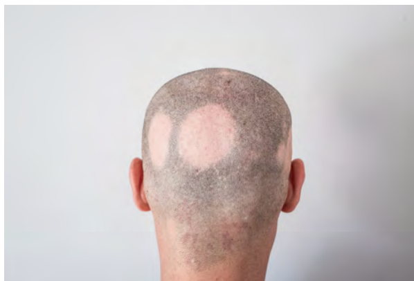
Figure: Alopecia Areata

Alopecia areata is an autoimmune condition that affects about 1 in 500 adults. In alopecia areata, the immune system attacks the body's own hair follicles—leading to patches of hair loss on the scalp, face, and other areas of the body. Typically, these bald patches appear suddenly and in some patients, can involve the whole body. Recurrence is common and most sufferers will have several episodes during their lifetimes. A small percentage of patients have persistent hair loss even with treatment. Alopecia areata has been shown to lead to significant psychosocial impacts in patients, negatively impacting self-esteem, body image, and/or self-confidence.