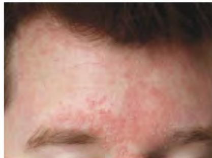
Figures: Seborrheic Dermatitis