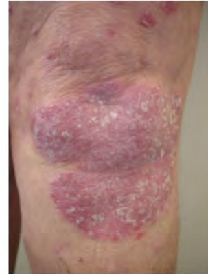
Figures: Plaque Psoriasis