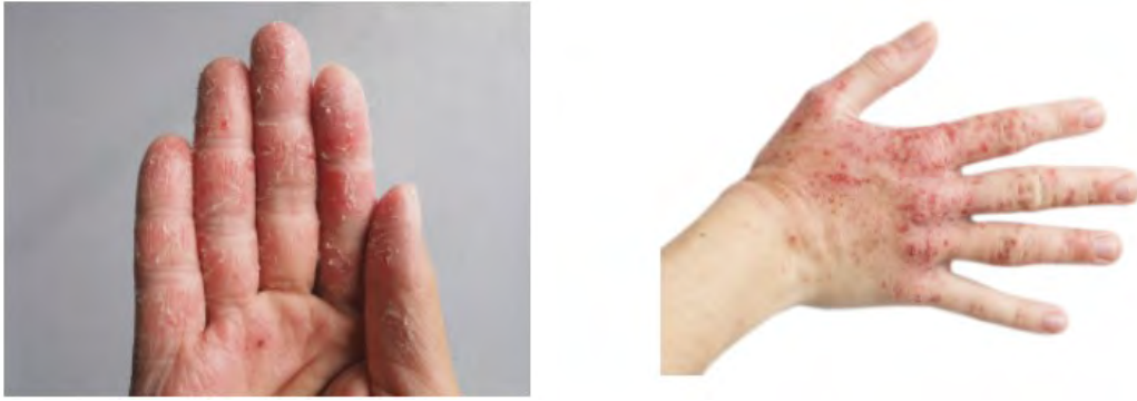
Figures: Hand Eczema