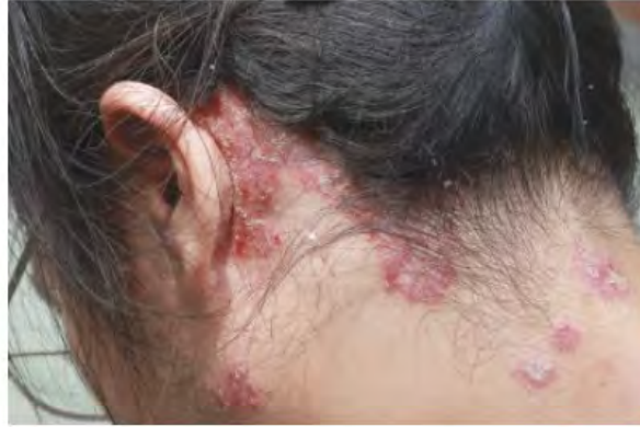
Figures: Scalp Psoriasis