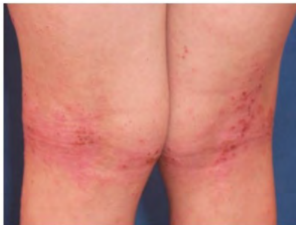
Figures: Atopic Dermatitis

Atopic dermatitis is the most common type of eczema, affecting approximately 26 million people in the United States. Atopic dermatitis is the most common skin disease among children, with prevalence steadily increasing from 8% to 12% in the last two decades. Atopic dermatitis is characterized by a defect in the skin barrier, which allows allergens and other irritants to enter the skin, leading to an immune reaction and inflammation. This reaction produces a red, itchy rash, most frequently occurring on the face, arms and legs, and the rash can cover significant areas of the body (see figures below). The rash causes significant pruritus (itching), which can lead to damage caused by scratching or rubbing and perpetuating an 'itch-scratch' cycle.