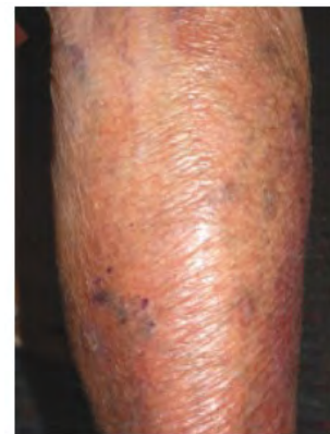
Figures: Steroid-induced striae (left) and Steroid-induced skin atrophy (right)