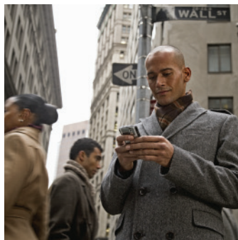
Enhanced Cellular Coverage & Capacity