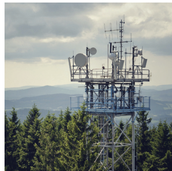
Wireless Base Stations