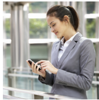
Mobile Devices & Accessories