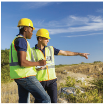
Site Survey Test & Maintenance