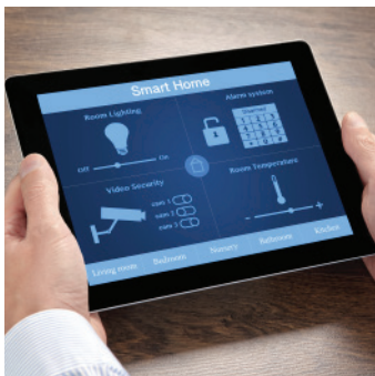
Internet of Things