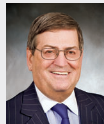
Kenneth M. Duberstein

Chairman & CEO, The Duberstein Group, Inc.