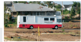
“The View from Main Street” provides the perspective of our agents as they discuss the storm and their partnership with Travelers.