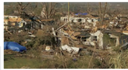
“Still Standing with You” is the story of how the storm affected the communities of Tuscaloosa, Birmingham and Cullman, told from the point of view of Travelers Business and Personal Insurance customers, agents and employees.

Visit travelers.com/stormstories to view a series of brief videos that capture our customers’ stories from the 2011 Alabama tornadoes — in their own words.