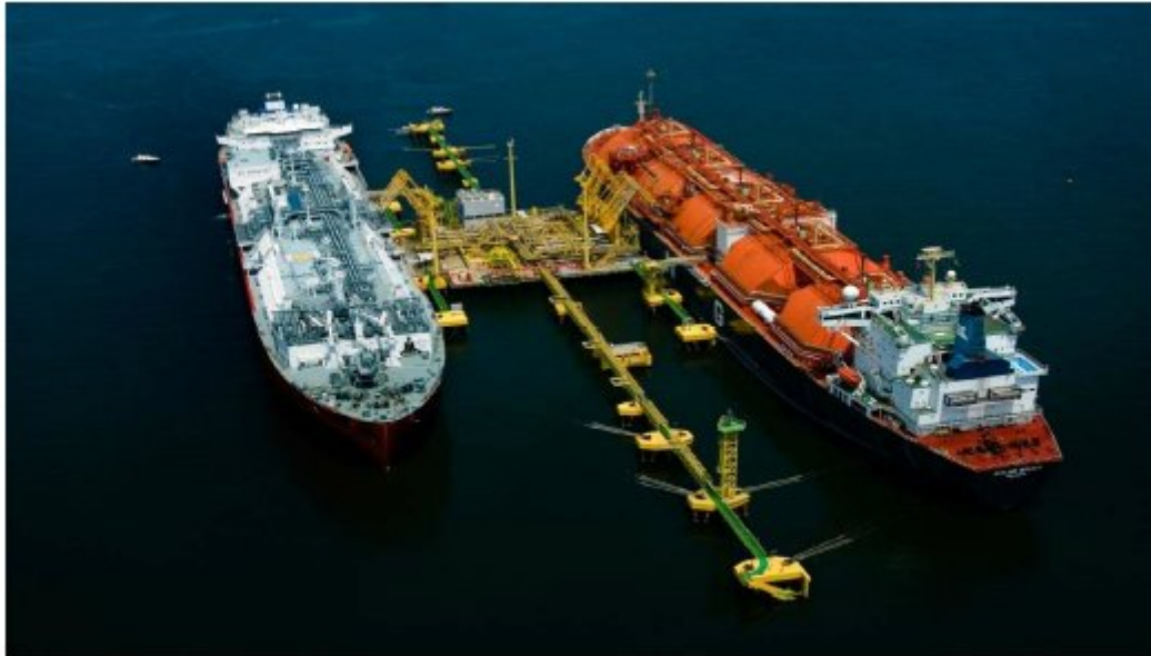
Golar Spirit FSRU receiving cargo from LNG Carrier in Guanabara Bay, Rio de Janeiro

and time have become the main drivers behind the growing interest in the various types of floating LNG regasification projects. FSRUs projects can typically be completed in less time (2 to 3 years compared to 4 or more years for land based projects) and at a significantly lower cost (20-50% less) than land based alternatives.