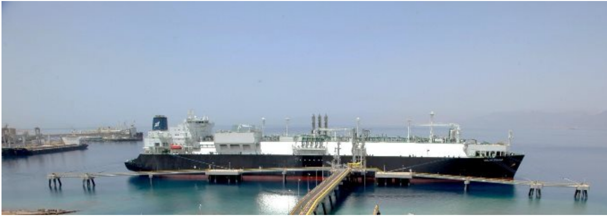
FSRU Golar Eskimo moored off the port of Aqaba in Jordan

FSRU facilities are significantly less likely than onshore facilities to be met with resistance in local communities, which is especially important in the case of a facility that is intended to serve a highly populated area where there is a high demand for natural gas. As a result, it is typically easier and faster for FSRUs to obtain necessary permits than for comparable onshore facilities. More recently, cost and time have become the main drivers behind the growing interest in the various types of floating LNG regasification projects. FSRU projects can typically be completed in less time (2 to 3 years compared to 4 or more years for land based projects) and at a significantly lower cost (20-50% less) than land based alternatives.