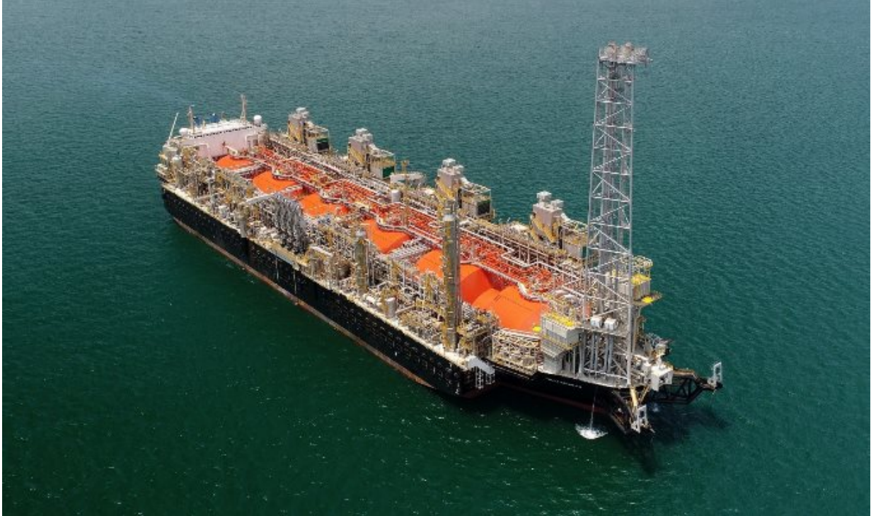
FLNG Hilli Episeyo shortly before departure from Singapore

Golar's floating liquefaction strategy is to target stranded reserves (such as coal bed methane and shale gas or lean gas sourced from offshore fields) and convert this to LNG. These feed gas streams require little to no gas processing prior to liquefaction. Golar's liquefaction solution places proven onshore technology on board an existing LNG carrier using a rapid low-cost execution model resulting in a vessel conversion time of approximately three years. In 2014 Golar executed agreements with Keppel and Black & Veatch for the conversion of the LNG carrier Hilli to an FLNG vessel at Keppel's shipyard in Singapore. FLNG Hilli has a production capacity of up to 2.5 million tonnes per annum and on board storage of approximately 125,000 cubic meters of LNG. The FLNG Hilli delivered from Keppel's shipyard in October 2017 and proceeded to Cameroon, arriving in late November 2017. Commissioning of the vessel commenced in December 2017 and production of LNG began in mid-March 2018. We expect acceptance testing procedures to commence shortly. After customer acceptance, Golar expects to close the sale of an initial equity interest in the vessel to Golar Partners. Hilli is the world's first FLNG vessel based on a converted LNG carrier and one of only four FLNG vessels globally.