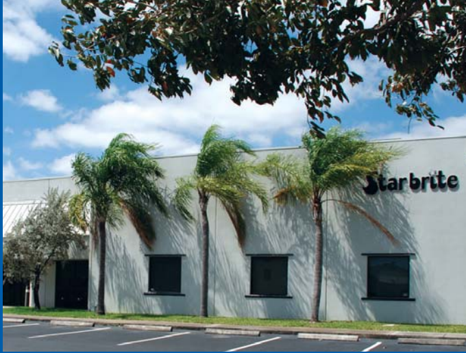
CORPORATE OFFICES • FORT LAUDERDALE, FLORIDA