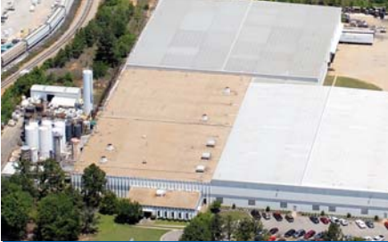
MANUFACTURING & DISTRIBUTION FACILITIES MONTGOMERY, ALABAMA

Ocean Bio-Chem, Inc.'s main manufacturing and distribution facility is its wholly-owned subsidiary, Kinpak, Inc., located on a 20 acre site in Montgomery, Alabama. In addition to manufacturing Star brite® products, Kinpak also manufactures numerous items under private label programs. The facility's 200,000 sq. ft. manufacturing, blending, packing and distribution center features a 500,000 gallon tank farm, as well as a fully-equipped R&D laboratory, a facility for the production of chlorine dioxide products and a quality control center that performs quality audits for each phase of the production process.