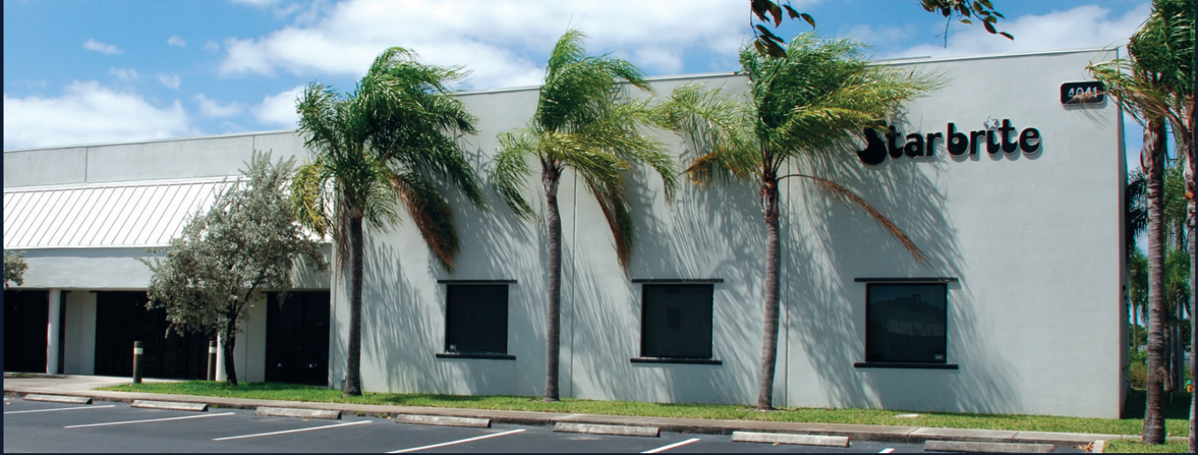
CORPORATE OFFICES • FORT LAUDERDALE, FLORIDA