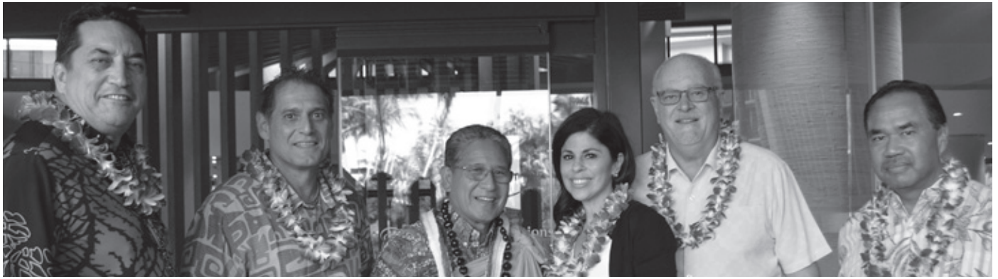
Traditional Hawaiian Blessing Ceremony at the new Ocean Tower by Hilton Grand Vacations Club, hosted by a Hawaiian kahu (guardian or minister) to honor those of the past, present, and future.