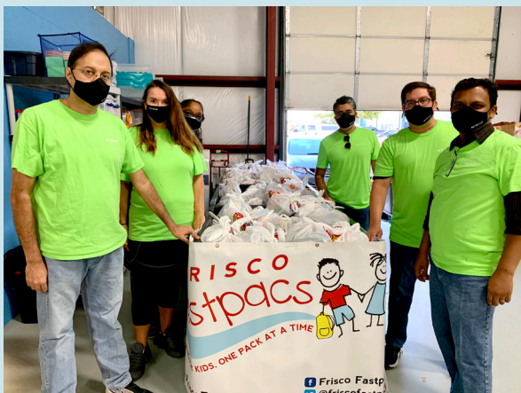
School children in need received weekend meals packaged by Guardians from our Allen, TX office in November 2020.

NETSCOUT continued its commitment to our corporate social responsibility agenda during the global pandemic as it universally accentuated stress points. With passion, flexibility, and creativity, NETSCOUT Guardians around the world continued to volunteer and participate in virtual and in-person events, such as the one pictured here. NETSCOUT corporate sponsorships in support of various organizations and initiatives continued as well. A few examples of organizations NETSCOUT supported include Tech Goes Home, which addresses the digital divide by providing computers, internet access and digital skills training in underserved communities; NPower’s Command Shift, a coalition of nonprofit and corporate partners committed to accelerating more women of color in technology; an Annual Civic Hackathon with Shooting Stars Foundation, which helps foster students’ interest in STEM topics and community issues. Additionally, NETSCOUT offered leadership and encouragement to foster COVID vaccinations and continued to provide aid to underserved communities. We are proud of our Guardians and pleased to support these efforts through our “Heart of Giving” program.