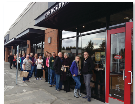
Opening Day, Richmond, VA