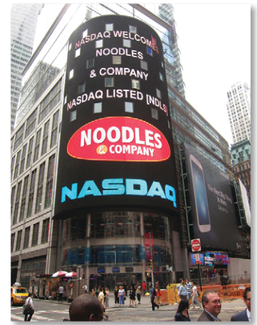
Times Square, June 28, 2013

During the first half of 2013, we implemented new merchandising throughout our restaurants that better communicates the menu, improves throughput, and more effectively introduces the brand to new guests. Aside from improving order taking time that occurs using the new merchandising, we have made further progress in enhancing throughput at our restaurants through better register utilization, design improvements and labor deployment.