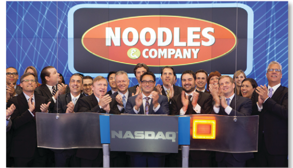
Opening Bell, NASDAQ

This past year we also continued to capitalize on our strengths with families and the dinner daypart by beginning to roll out an enhanced level of service in several of our restaurants, complemented by a focused line of coffee, tea, and desserts, as well as improved beer and wine offerings. We feel we have some of the friendliest team members in the industry, and an elevated focus on hospitality is a natural part of our DNA.