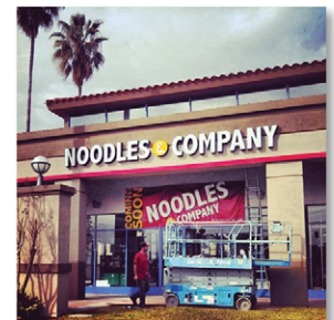
Coming Soon, Cupertino, CA