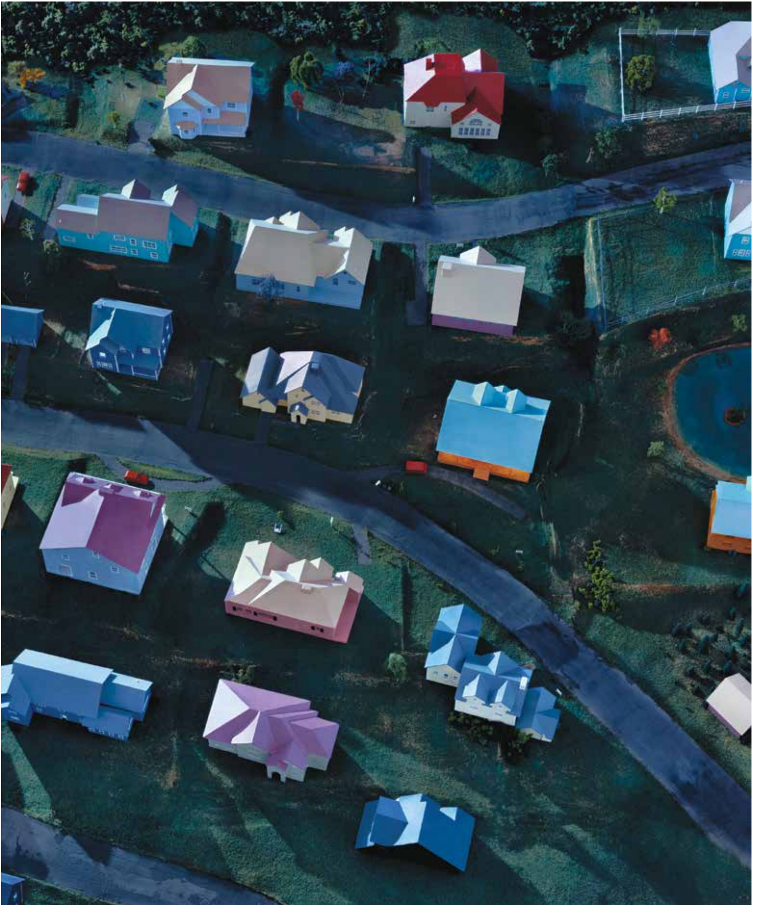
JAMES CASEBERE, LANDSCAPE WITH HOUSES (DUTCHESS COUNTY, NY) #2, 2010 (DETAIL)