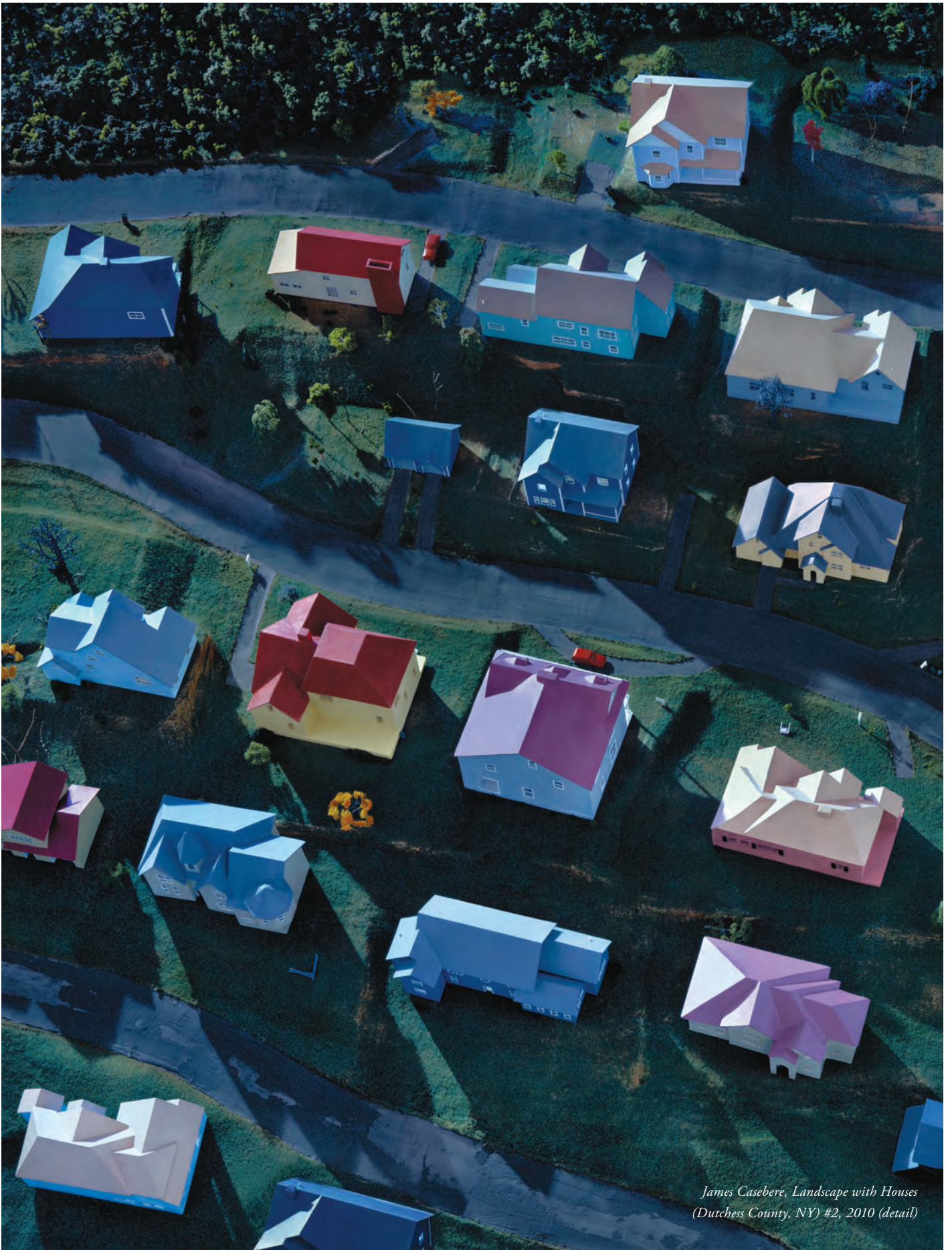
James Casebere, Landscape with Houses (Dutchess County, NY) #2, 2010 (detail)