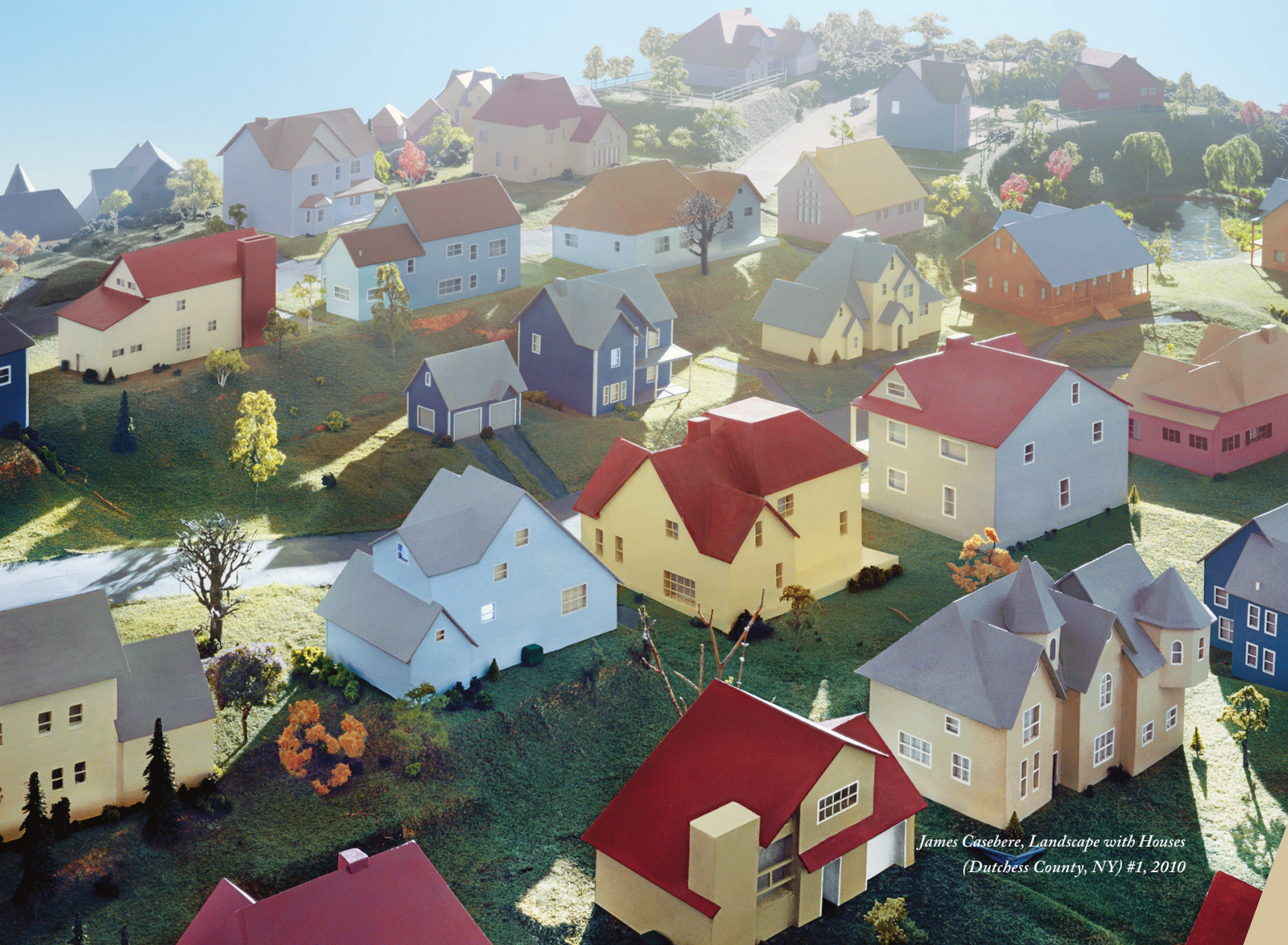
James Casebere, Landscape with Houses (Dutchess County, NY) #1, 2010