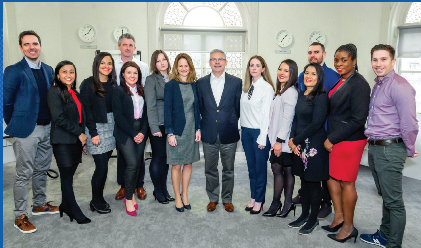
Noden Pharma — Dublin, Ireland