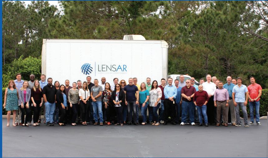
LENSAR — Orlando, Florida