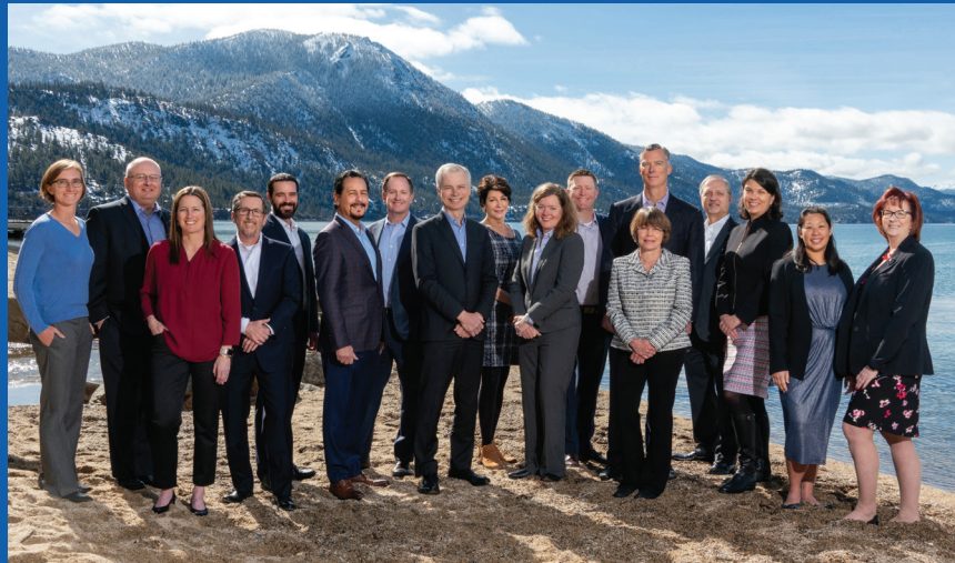
PDL BioPharma — Incline Village, Nevada

PDL BioPharma seeks to provide a significant return to its shareholders by entering into strategic transactions involving late clinical or early commercial stage pharmaceutical products and companies with attractive revenue growth potential.