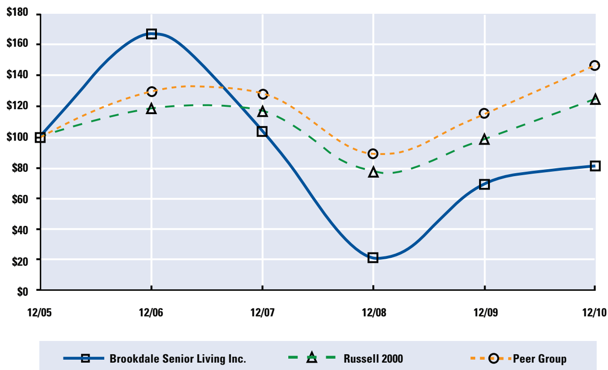
COMPARISON OF FIVE YEAR CUMULATIVE TOTAL RETURN AMONG BROOKDALE SENIOR LIVING INC., THE RUSSELL 2000 INDEX AND A PEER GROUP

Senior Living, Inc., Capital Senior Living Corporation, Five Star Quality Care, Inc., HCP, Inc., and Ventas, Inc. The graph assumes $100 invested on December 31, 2005 and $100 invested at that same time in each of the Russell 2000 Index and the peer group. The comparison assumes that all dividends are reinvested.