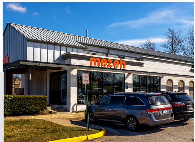
THE GLEN, WOODBRIDGE, VA

Shopping center same-store property operating income increased from $135.2 million in 2022 to $140.9 million in 2023, a 4.2% increase. In 2023, we executed 282 new and renewed leases and lease options totaling 1.6 million square feet. The expiring leases averaged $19.35 per square foot and were renewed or re-leased at an average $20.38 per square foot, a 5.3% increase in rental rate.