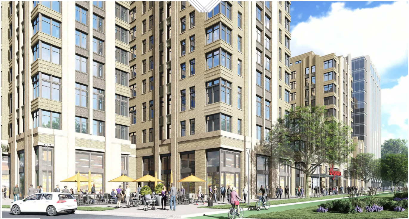
TWINBROOK QUARTER, ROCKVILLE, MD

Metrorail Orange and Silver Lines in Arlington, Virginia, opened in 2020. Ashbrook Marketplace, our newest grocery-anchored shopping center, located in Ashburn, Virginia, opened in 2019.