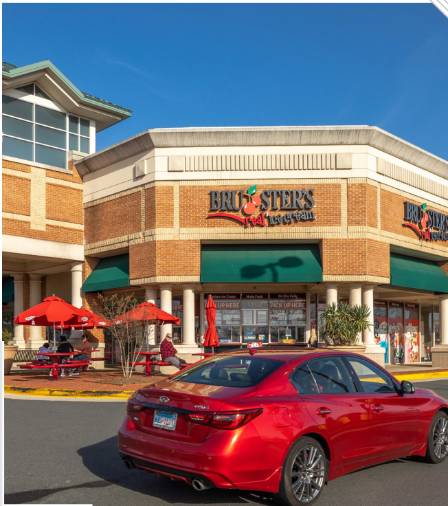
BROADLANDS VILLAGE, ASHBURN, VA