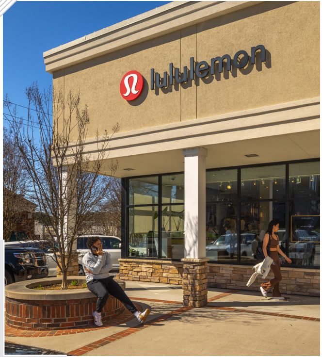
THRUWAY, WINSTON-SALEM, NC

House, respectively. Additionally, our dividend reinvestment plan supplements our borrowing availability and operating cash flow to ensure adequate liquidity.