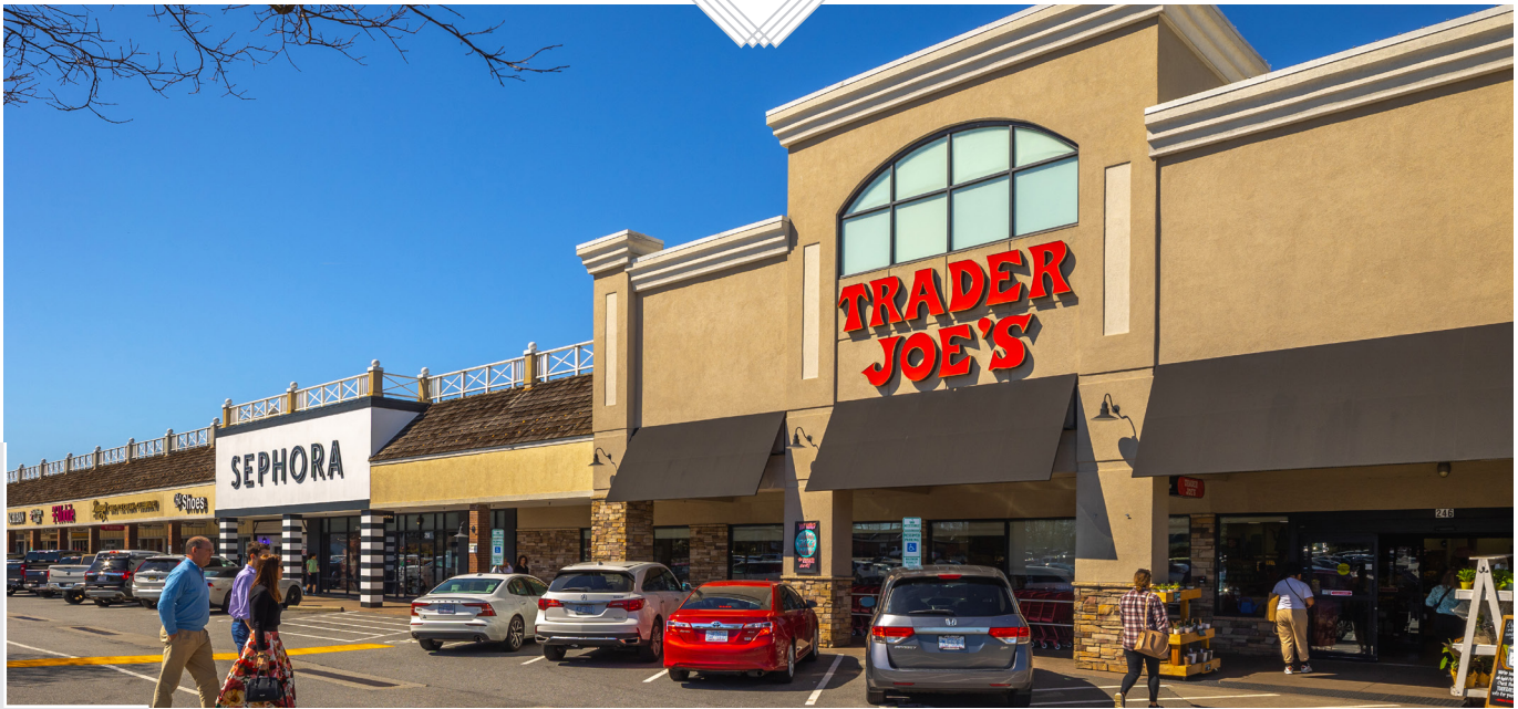
THRUWAY, WINSTON-SALEM, NC