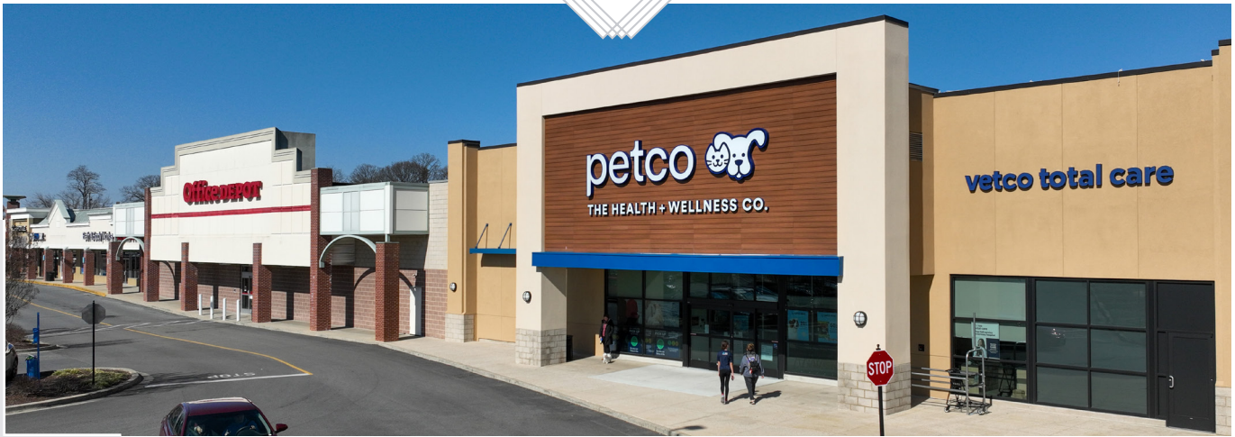
SEVERNA PARK MARKETPLACE, SEVERNA PARK, MD