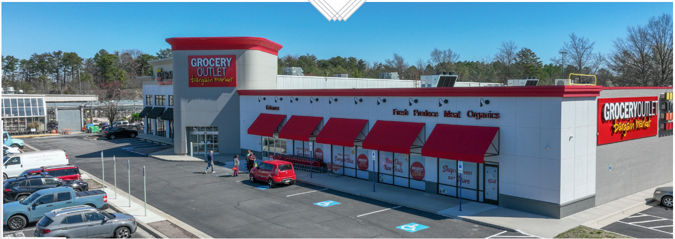
SOUTHDALE, GLEN BURNIE, MD