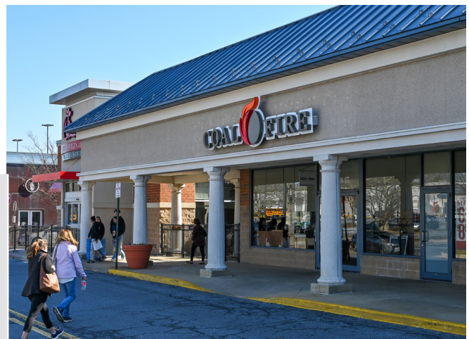
KENTLANDS, GAITHERSBURG, MD