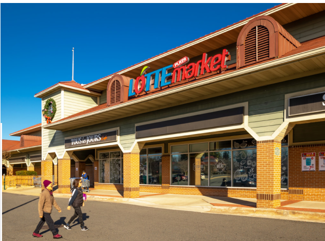
COUNTRYSIDE MARKETPLACE, STERLING, VA

Our four office mixed-use properties are all located in the greater Washington, DC region. The office market continues to be challenging. In 2023, approximately 230,000 square feet of expiring leases at an average $38.68 per square foot were renewed or re-leased at an average $36.70 per square foot, a 5.1% decrease. Nevertheless, in spite of office market headwinds, our office leased percentage increased 350 basis points during 2023, from 82.5% to 86.0%. Only 5.5% of leases at our office mixed-use properties, as measured by annual base rent, are scheduled to expire in 2024.