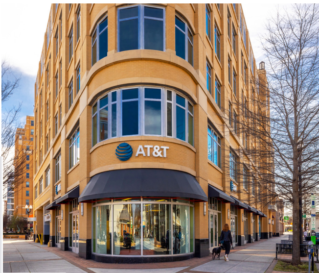
CLARENDON, ARLINGTON, VA

Where possible, we leverage land available at our existing shopping centers to add free-standing pad site buildings. In 2023, Shake Shack opened at a new 3,200 square foot pad site at Kentlands Square in Gaithersburg, Maryland, and Wendy's opened at a new 2,700 square foot pad site at Beacon Center in Alexandria, Virginia. We have executed leases or leases are under negotiation for five more to-be-developed pad sites.