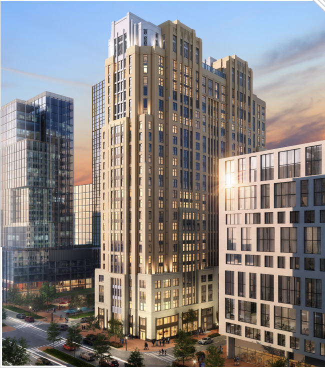
HAMPDEN HOUSE, BETHESDA, MD