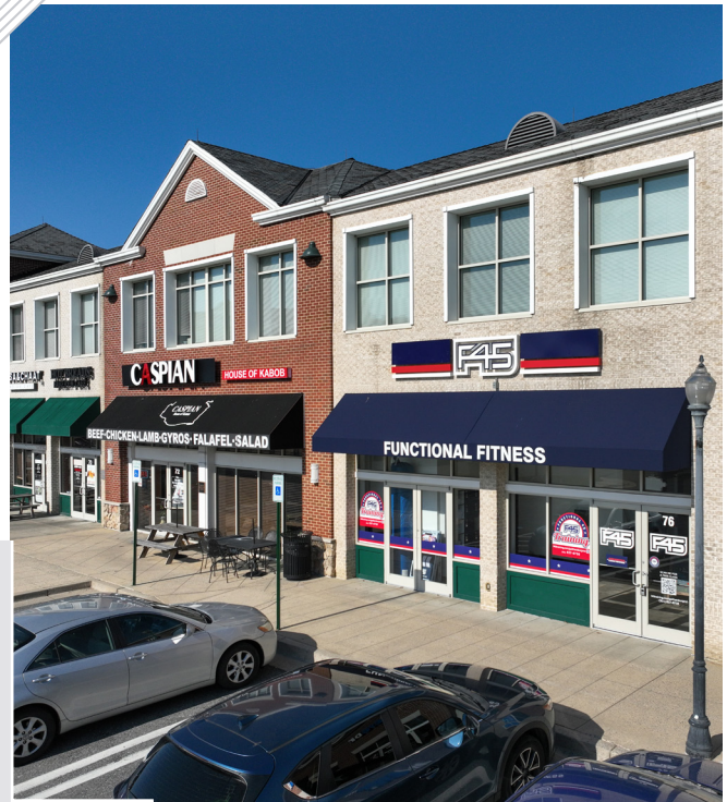
KENTLANDS, GAITHERSBURG, MD