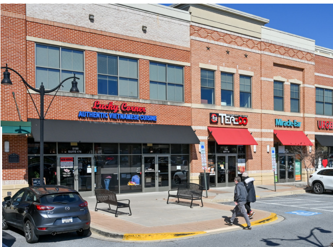
WESTVIEW VILLAGE, FREDERICK, MD

In recent years, we have grown organically through ground-up development. Park Van Ness, a residential mixed-use property along the Metrorail Red Line in upper Northwest Washington, DC, opened in 2016. The Waycroft, a mixed-use property with residential and retail along the