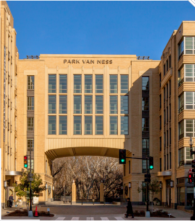
PARK VAN NESS, WASHINGTON, DC

Residential same-property operating income increased 13.0% from 2022 to 2023.