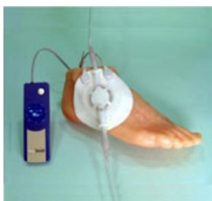
Picture of WoundShield Driver and Instillation Patch

WoundShield delivers surface acoustic waves to the location of the wound. Surface acoustic waves move laterally across the surface of the wound, which enables the transfer of the acoustic energy of the waves along the entire wound surface in a continuous and consistent mode, providing access to the waves’ benefits for a longer treatment period than conventional ultrasound without the need for supervision or a treatment session by a clinician.