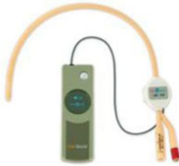
Picture of UroShield with actuator

Clinical studies of the UroShield system have supported the following advantageous effects: