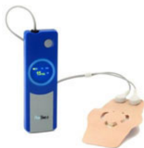
Picture of PainShield with Patch