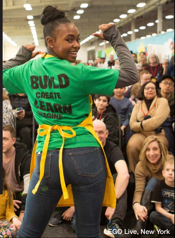
LEGO Live, New York