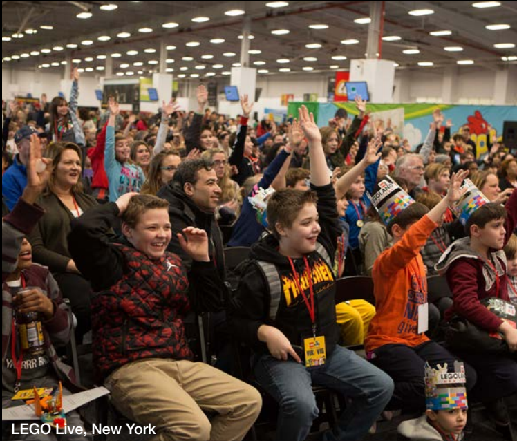
LEGO Live, New York