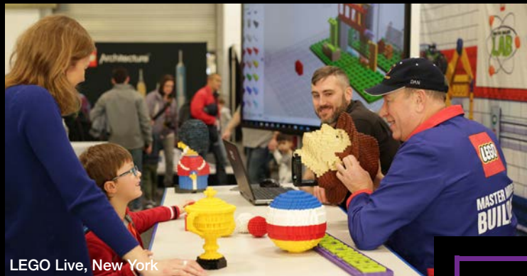
LEGO Live, New York