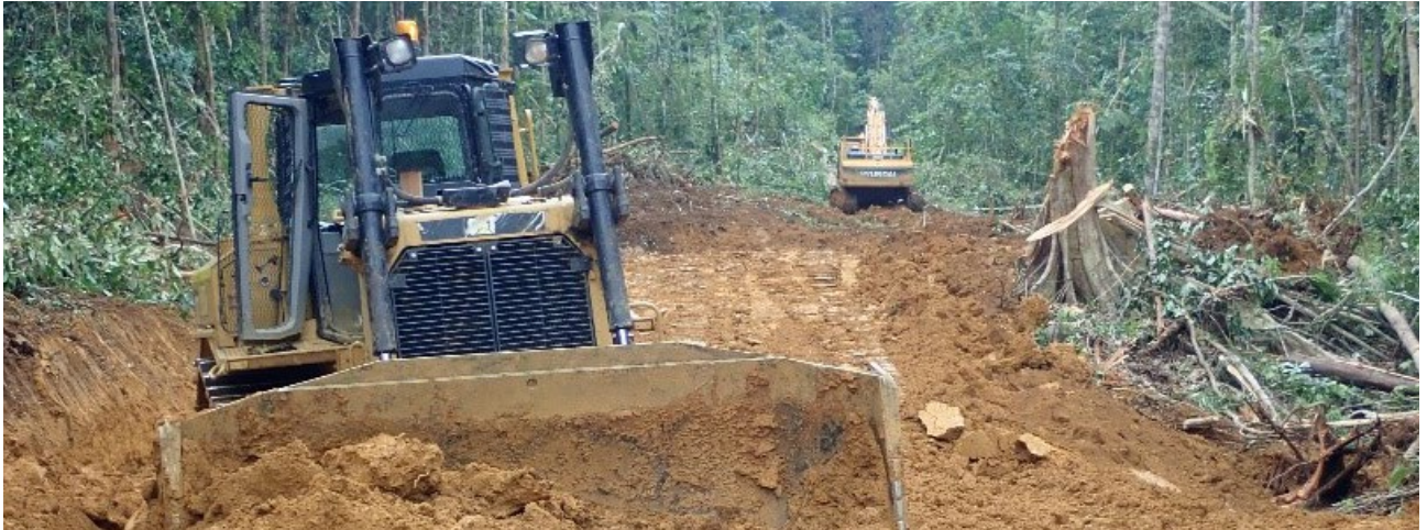
Figure 4: Construction of Road Infrastructure

The construction of new roads, repair of existing roads, and construction of a wharf causeway continued during the year. The wharf road is being constructed to considerably shorten the distance from the new wharf location to the plant site. Investment in this new road infrastructure will reduce the disturbance to the local residents and will leave the existing wharf available for community use.