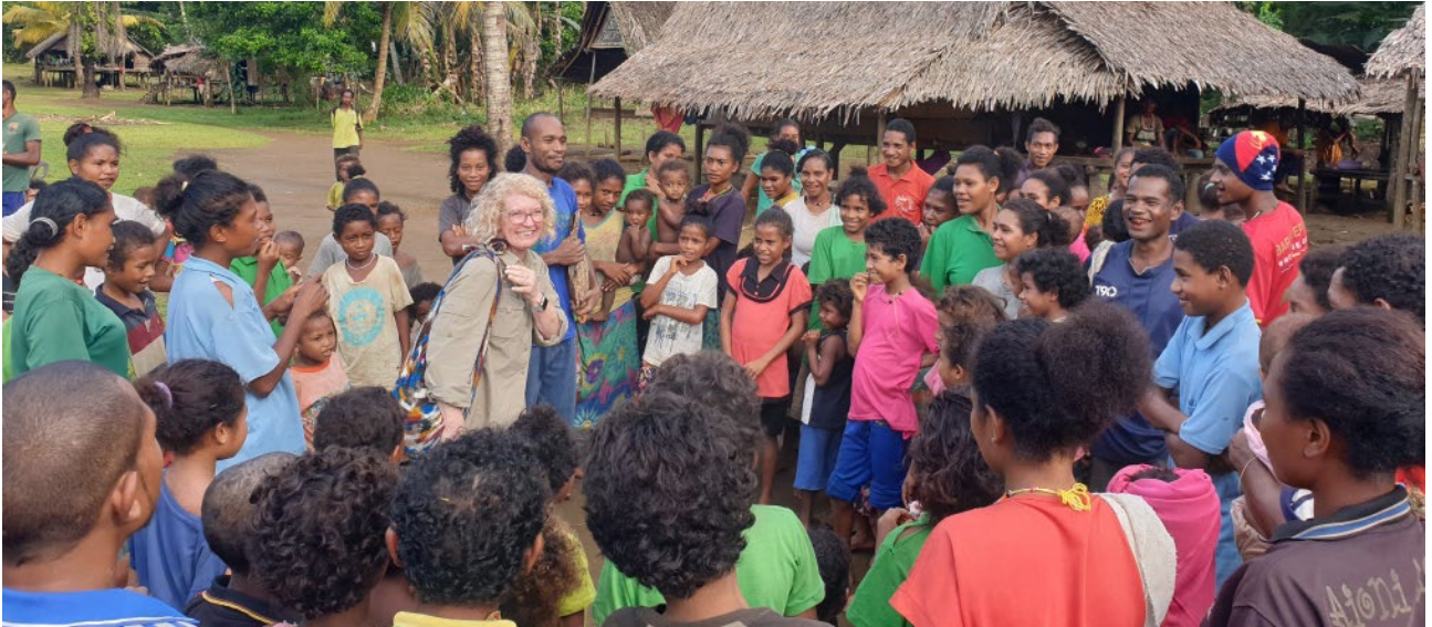
Figure 8: Geopacific Enjoys and Active and Strong Relationship with the Local Community