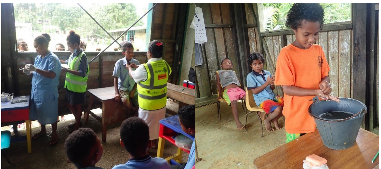
Figure 5 and 6: Community Health and Safety Programs