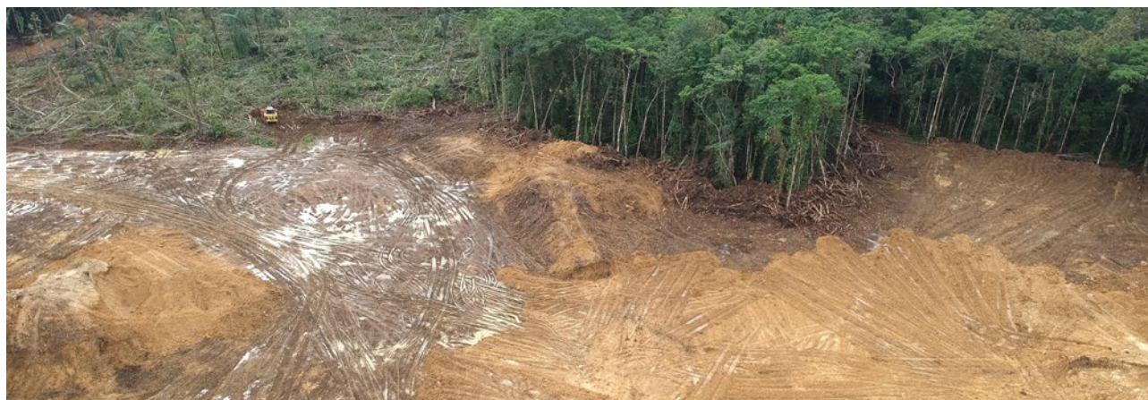
Figure 3: Plant site Land Clearing

Land clearing activities in preparation for the construction of community relocation houses continued in 2020. At the end of December 2020, 131 housing sites had been cleared. In addition to the house clearing, ground preparation works were completed at the new community school site and on the community church site.