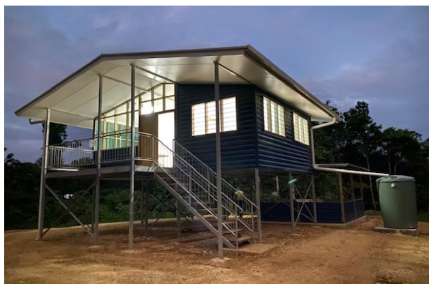
Figure 2: Three room deluxe house

Following community feedback and after extensive consultation with all stakeholders, the house designs were revised. The fundamental change was that the minimum house size was increased to three bedrooms, while other modifications included elevating all houses to allow for future expansion and the addition of a separate cook house for each dwelling. Upon review by all stakeholders, including the community, regulator and government officials the substantially improved relocation package was approved and ratified as a registered relocation agreement under the auspices of the Mineral Resources Authority (MRA). Registration of these documents formalised