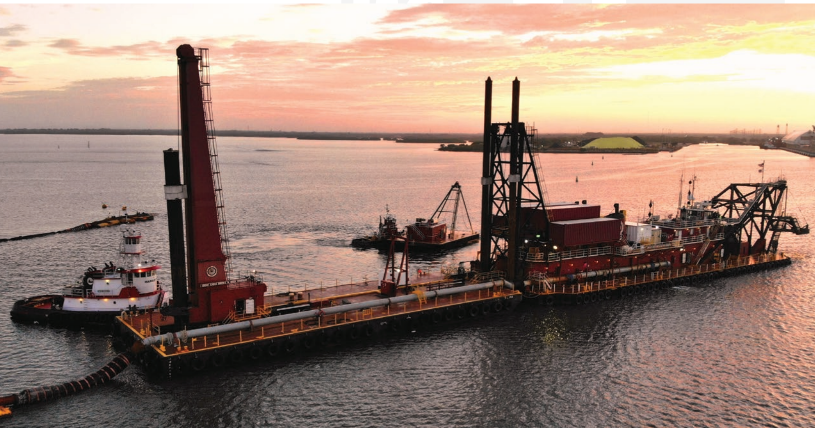
Dredge Alaska at Sunset—Big Bend Channel Port Deepening, Tampa Bay, Florida