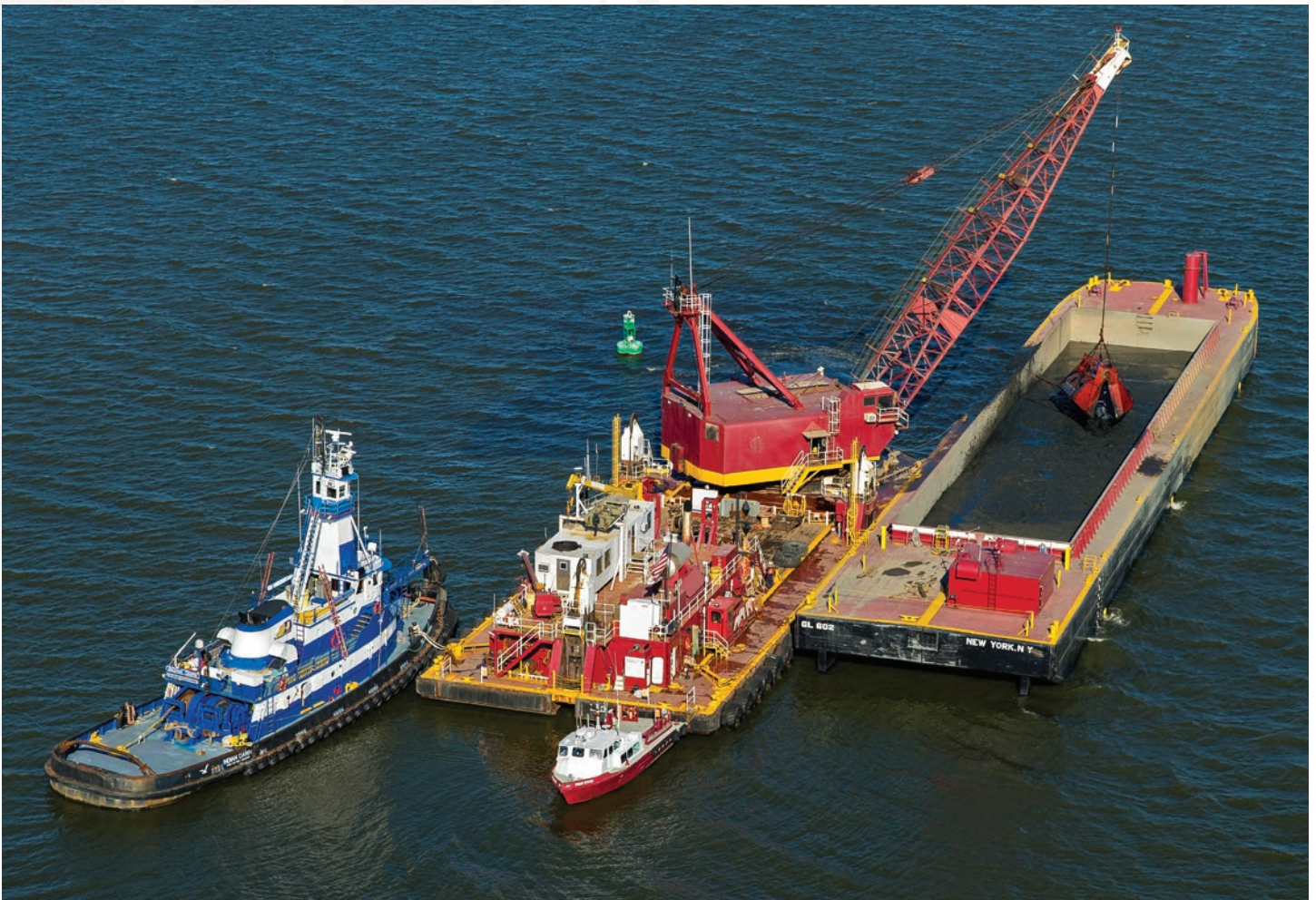
Clamshell Dredge 54 Performing Maintenance Dredging—Baltimore, Maryland