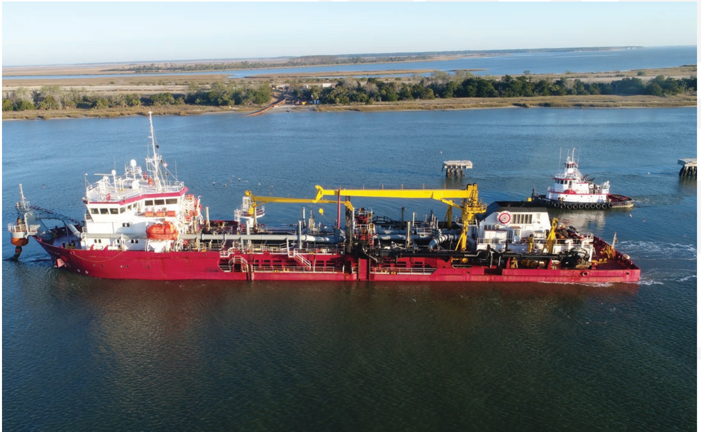
Dredge Liberty Island Creating Habitat from Deepening of Savannah Entrance Channel