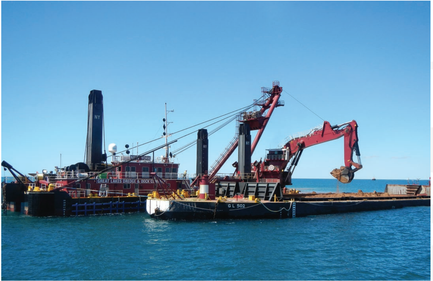
Backhoe Dredge New York, Delaware River Deepening Project