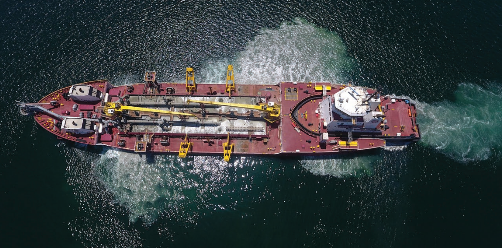
The 15,000 cubic yard capacity Ellis Island, the largest hopper dredge in the U.S.