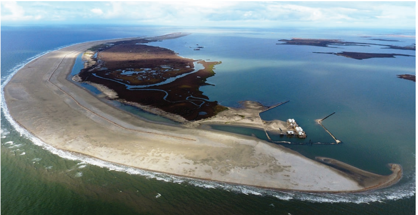
Whiskey Island Coastal Protection Project East End—Terrebonne Bay, Louisiana