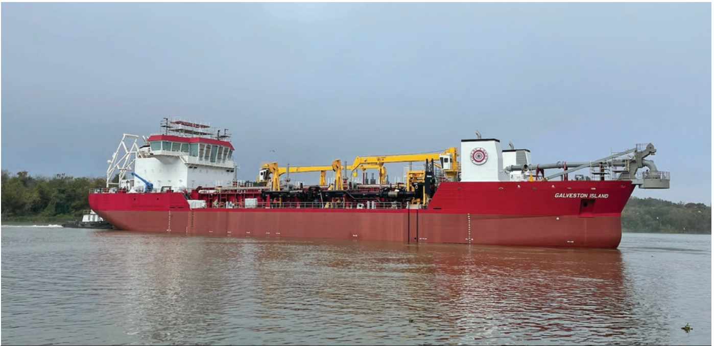
Trailing Suction Hopper Dredge Galveston Island , recently launched in Morgan City, Louisiana.