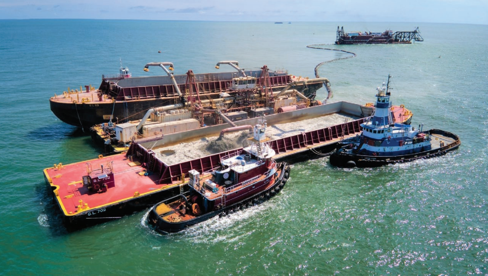
Spider Barge #175 loading sand, cooper marl, and rock from the Dredge Texas on the Charleston, South Carolina deepening project.