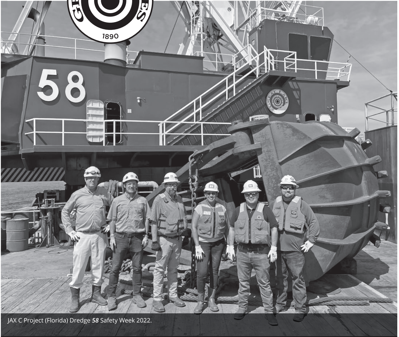
JAX C Project (Florida) Dredge 58 Safety Week 2022.