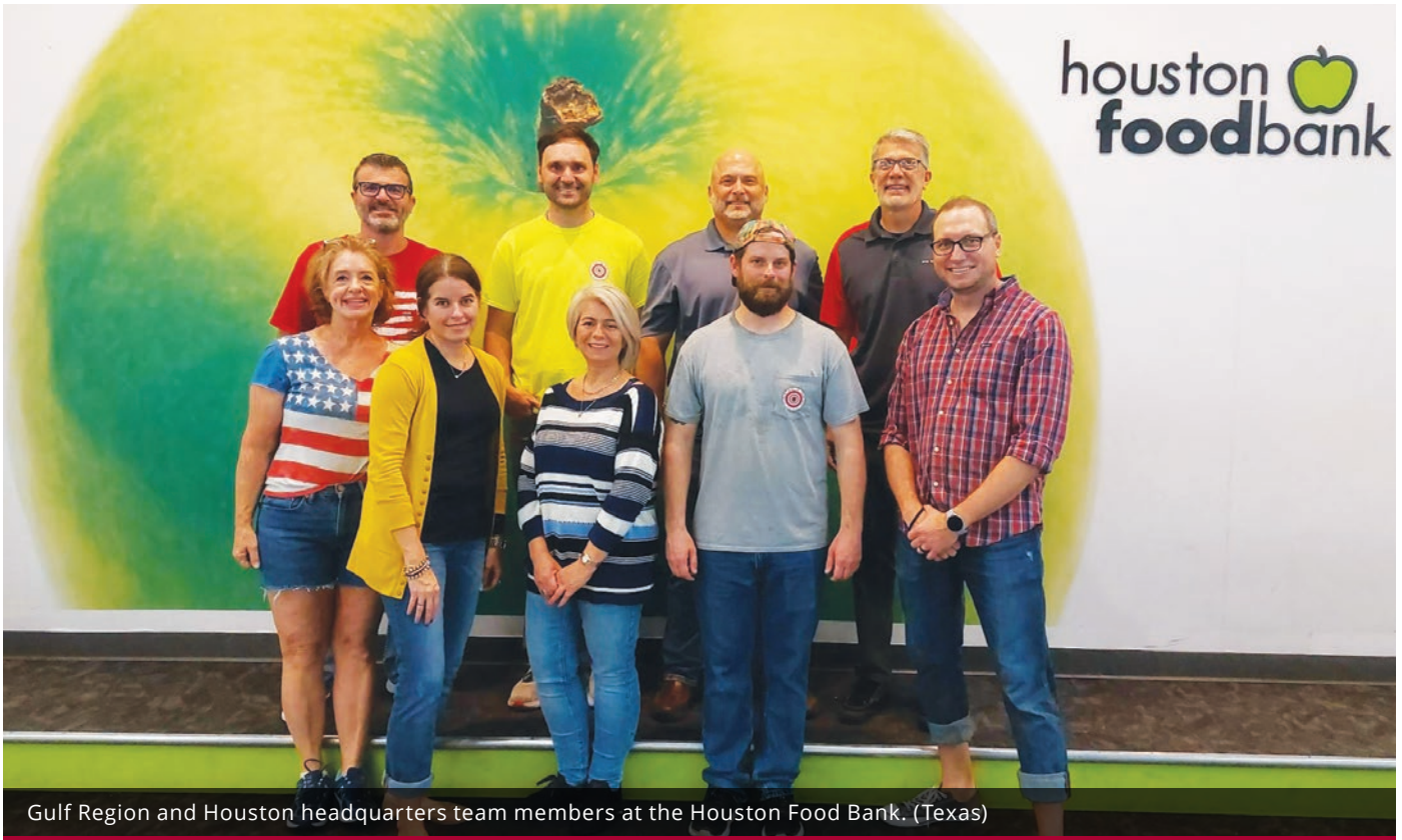
Gulf Region and Houston headquarters team members at the Houston Food Bank. (Texas)