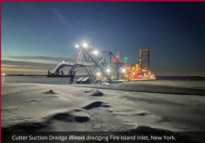
Cutter Suction Dredge Illinois dredging Fire Island Inlet, New York.