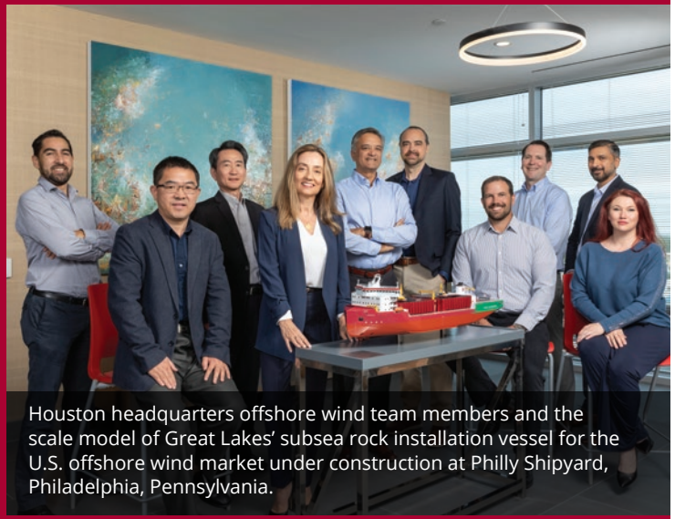
Houston headquarters offshore wind team members and the scale model of Great Lakes' subsea rock installation vessel for the U.S. offshore wind market under construction at Philly Shipyard, Philadelphia, Pennsylvania.

FOCUSING ON WORK THAT WILL STRENGTHEN OUR NATION'S INFRASTRUCTURE AND COASTLINE