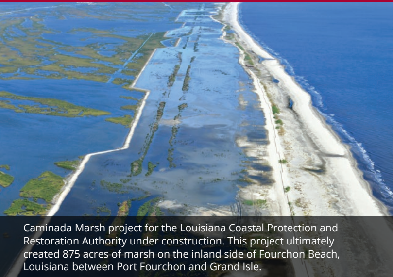
Caminada Marsh project for the Louisiana Coastal Protection and Restoration Authority under construction. This project ultimately created 875 acres of marsh on the inland side of Fourchon Beach, Louisiana between Port Fourchon and Grand Isle.