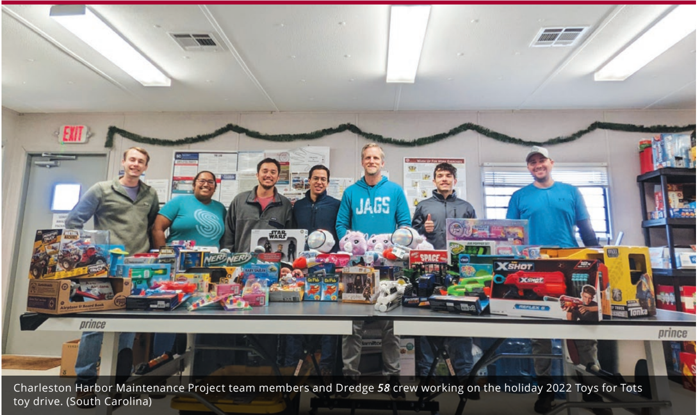
Charleston Harbor Maintenance Project team members and Dredge 58 crew working on the holiday 2022 Toys for Tots toy drive. (South Carolina)