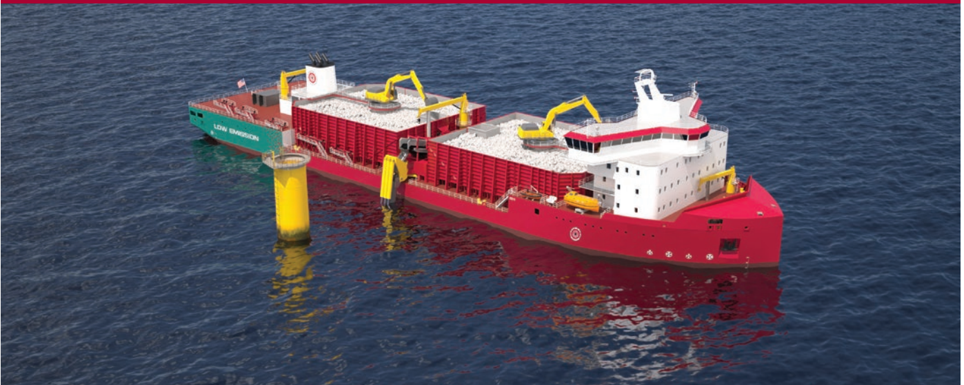
A rendering of Great Lakes' new subsea rock installation vessel for the U.S. offshore wind market.