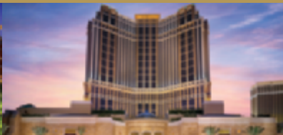
The Palazzo Las Vegas ~ December 2007