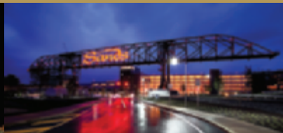
Sands Bethlehem Pennsylvania ~ May 2009