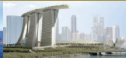
Marina Bay Sands Singapore ~ April 2010