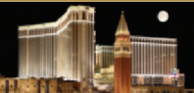
The Venetian Las Vegas ~ May 1999