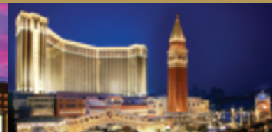
The Venetian Macao Macao ~ August 2007