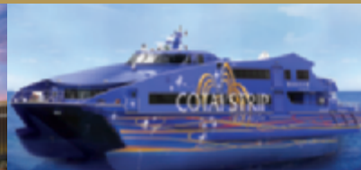
Cotai Strip CotaiJet Macao ~ November 2007