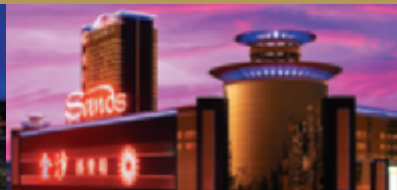
The Sands Macao Macao ~ May 2004