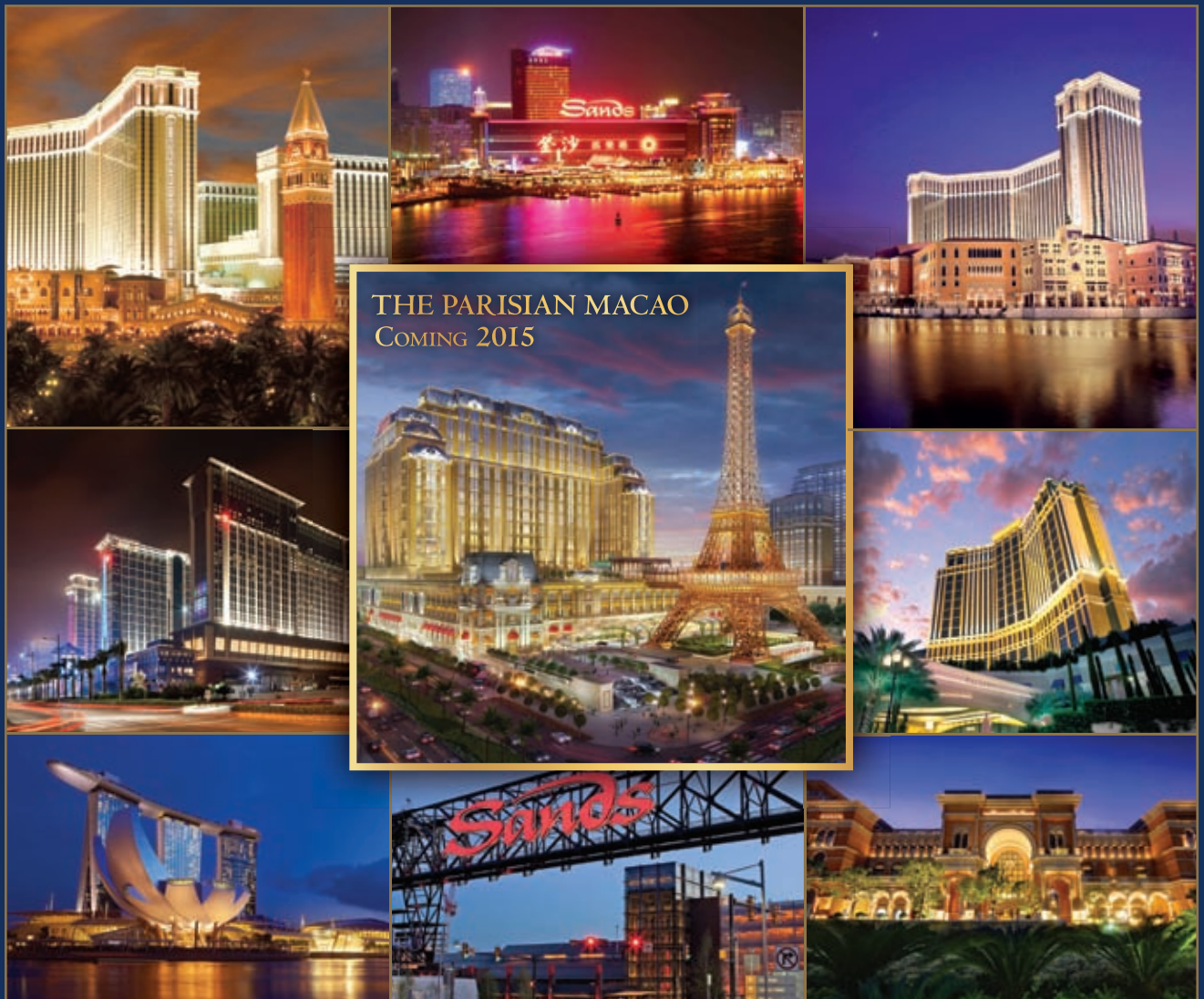
Clockwise from top left.