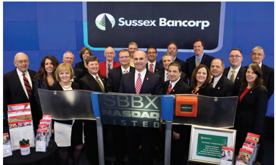
At the NASDAQ, we recently celebrated our 15th year of being listed on the exchange.

Being a good corporate citizen means giving back and helping the communities we serve through donations, charitable giving and volunteerism. To further our commitment we formed the SB Foundation, Inc. The purpose of our foundation is to make a positive impact by raising funds for charitable causes in the communities we serve. We look forward to making a difference.