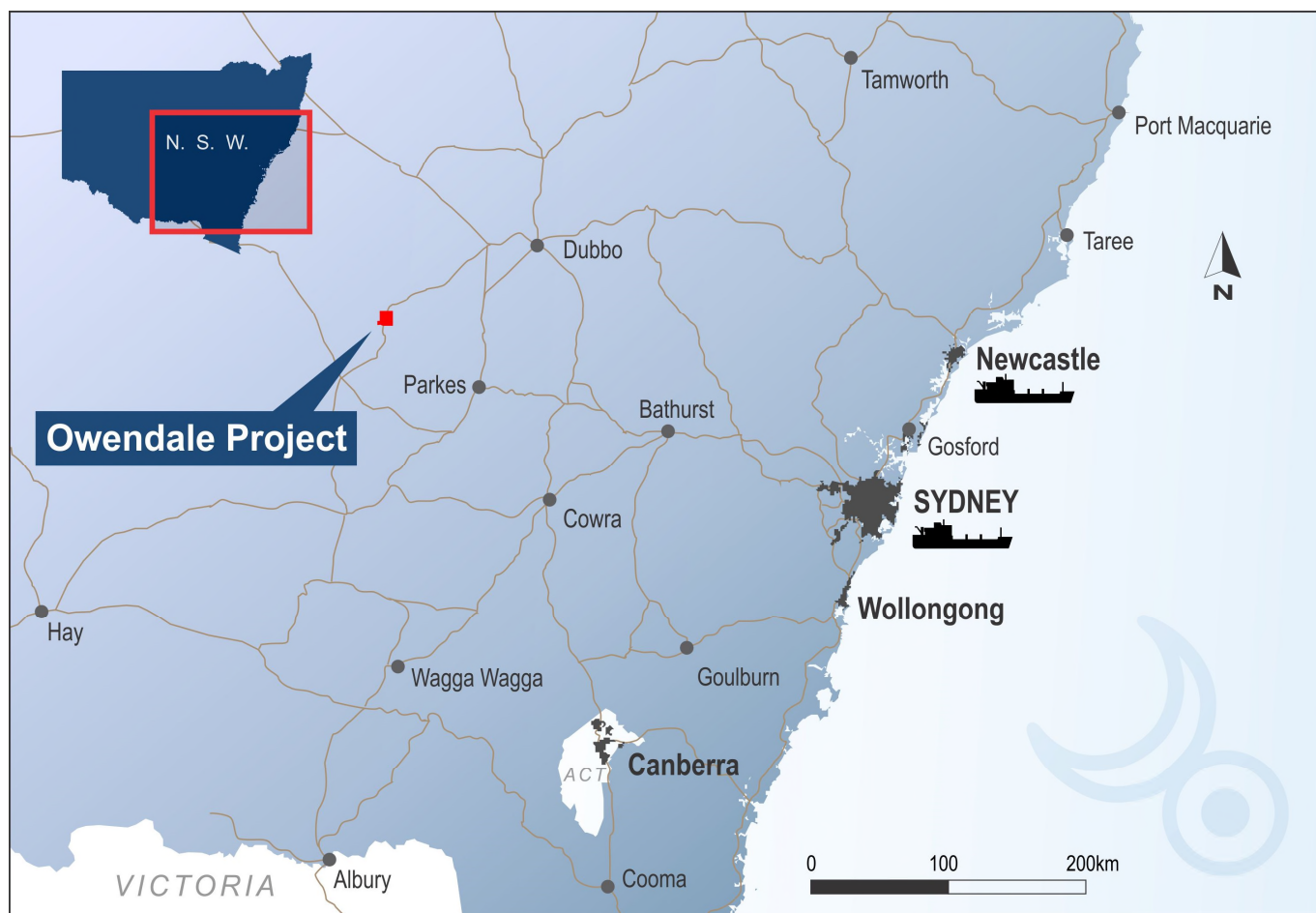
Figure 1: Owendale Project location

Owendale is located only 7km north east of Clean TeQ Energy's Syerston Scandium Project, which is the most analogous project given its similar size and grade.