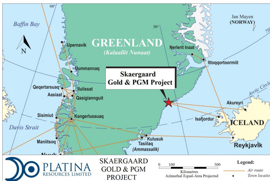
Figure 2: Location Map showing Skaergaard project

The Company maintains its own 20-person exploration camp at Skaergaard which also includes an airstrip, and messing facilities. The camp is utilized for both Skaergaard and the Qialivarteerpeik exploration licences.