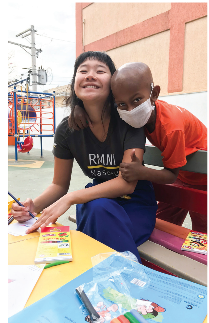
Rimini Street colleagues host an arts & crafts celebration at CAJEC, a non-profit organization in São Paulo, Brazil that provides free medical care and housing for children fighting cancer.

In all, we formed more than 50 community partnerships, donated more than $120,000 and volunteered approximately 1,200 employee hours in 2018.