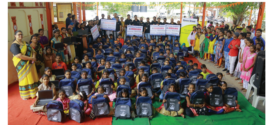
Rimini Street donates school supplies and laptops to students and tutors of Ekalavya Foundation, an after-school program for at-risk youth in the underserved communities of Hyderabad, India.

As part of our ongoing mission to support programs that provide long-term solutions for communities, we provided more than 100 children enrolled at the Ekalavya (India) after-school center with supplies, financial aid for the literacy organization Room to Read (global) and aid for the Tokyo Metro Blind People Welfare Association (Japan) and Kanner Foundation (Taiwan) for individuals living with intellectual limitations.