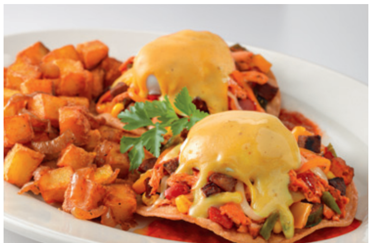
Baja Chicken Hash