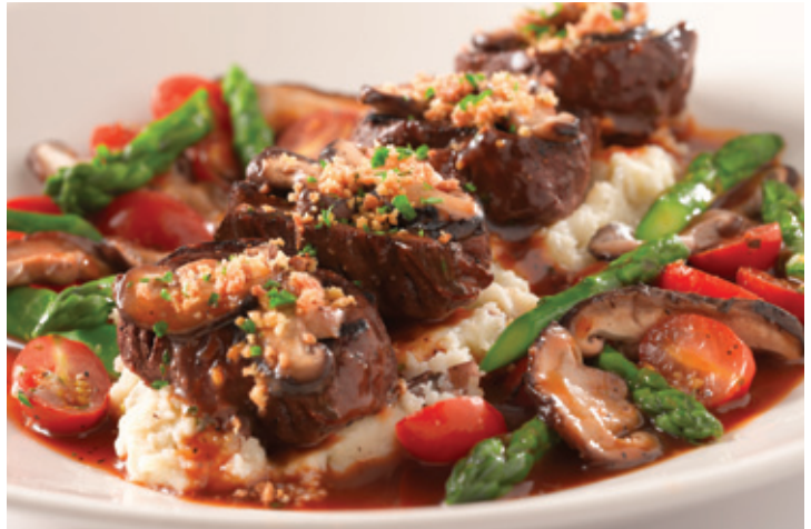
SkinnyLicious ® Grilled Steak Medallions

We expect 2015 to be another year of growth for our Company. We anticipate slightly higher than usual growth in sales from our existing base of restaurants, supported by a number of initiatives to increase guest traffic. In addition, we are planning for as many as