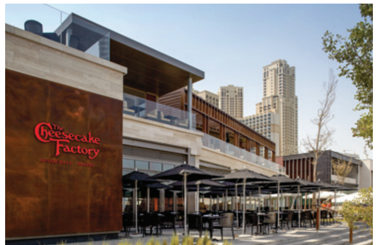
Dubai, United Arab Emirates (Jumeirah Beach Residence)