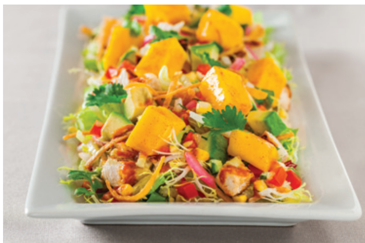
Cbili-Lime Chicken and Mango Salad

The Cheesecake Factory Incorporated has been a public company for well over two decades, and my annual letter to you provides me with an opportunity to reflect back on the past year, as I share our successes and opportunities, as well as outline our plans for the future.