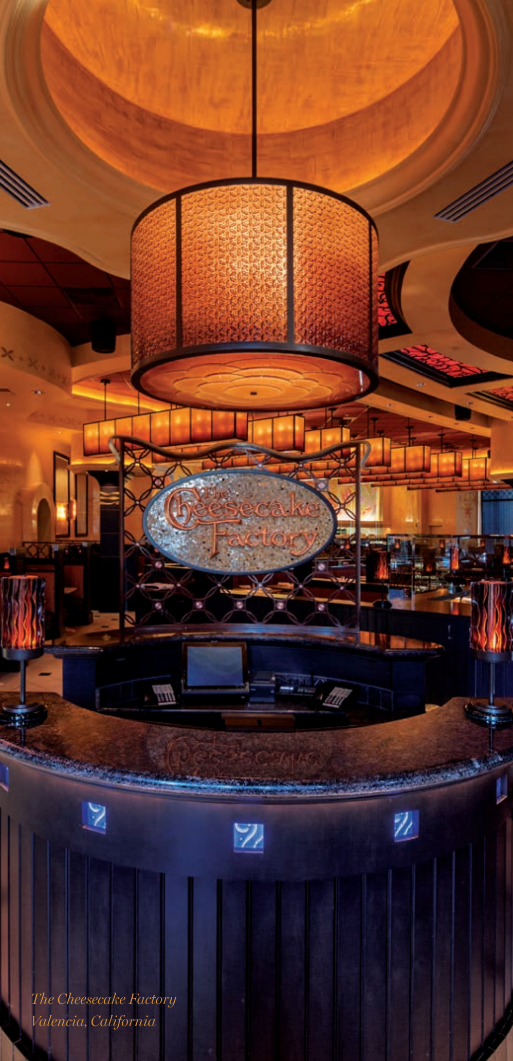
The Cheesecake Factory Valencia, California