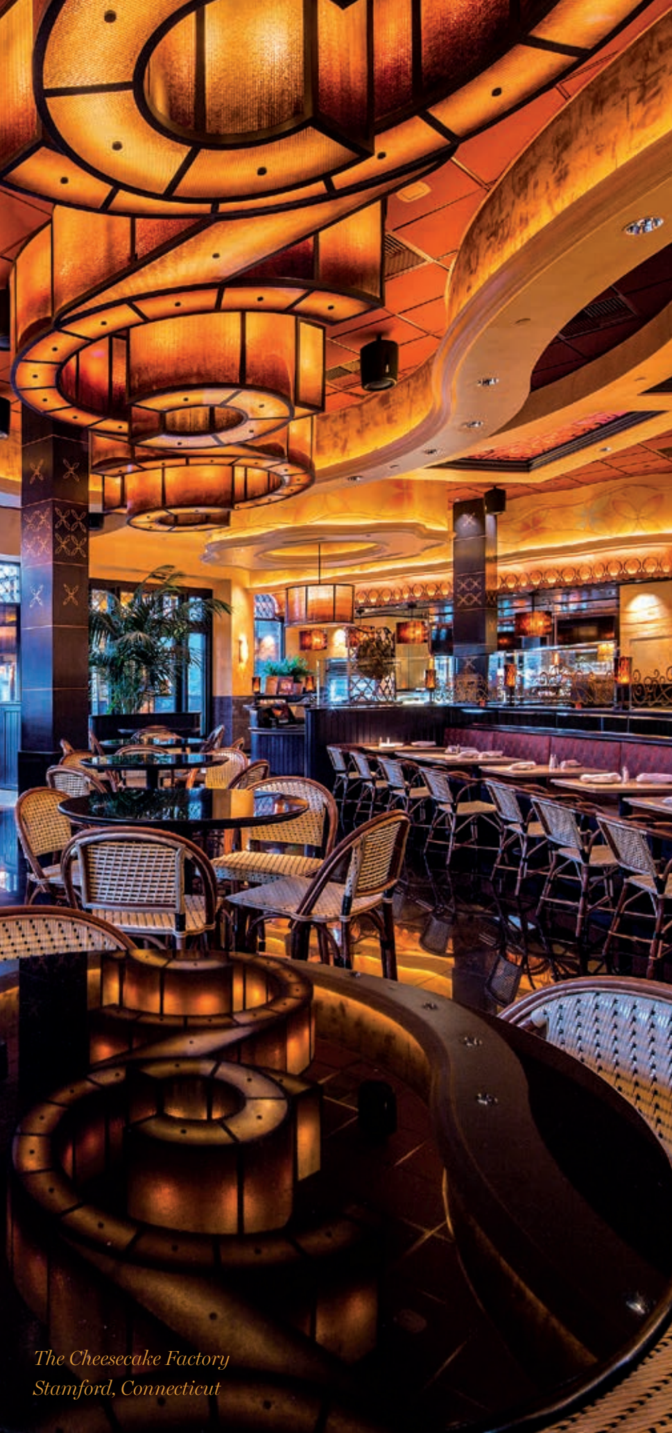
The Cheesecake Factory Stamford, Connecticut

We hit our stride in 2016 with regard to our global expansion as all three of our licensee partners opened restaurants during the year. Following four openings in 2016, we now have 15 Cheesecake Factory restaurants operating internationally in Mexico, the Middle East and China, where our first location at Disneytown, part of the Shanghai Disney resort, opened last June. Our licensees also opened restaurants in Qatar, another new market, as well as additional locations in Dubai and Mexico City. The Cheesecake Factory brand continues to resonate well internationally, and we look forward to continued growth of our international presence.