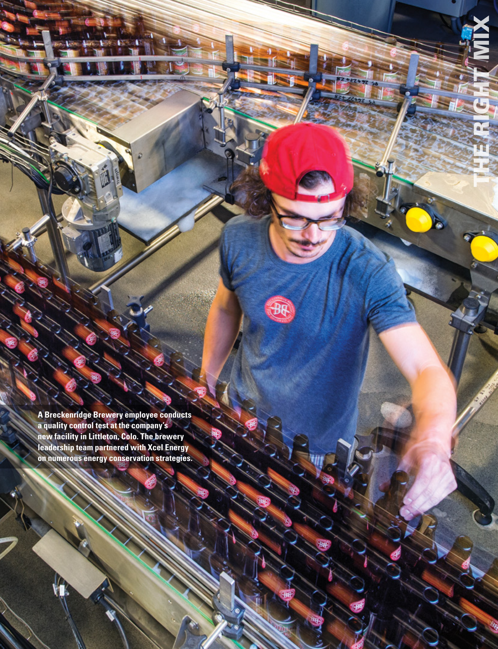
A Breckenridge Brewery employee conducts a quality control test at the company's new facility in Littleton, Colo. The brewery leadership team partnered with Xcel Energy on numerous energy conservation strategies.