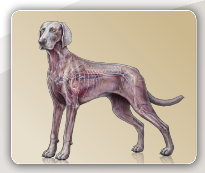
Webster acquired Odyssey Veterinary Software LLC in fiscal 2009, an early stage developer and marketer of Diagnostic Imaging Atlas software (DIA) that enables veterinarians to more fully explain and illustrate a pet's diagnosis and recommended treatment.

The companion-pet market is the fastest growing segment of the overall veterinary supply market. Pet ownership is continuing to grow steadily, and pet owners are willing to spend more on veterinary care for pets they consider to be a part of the family. To capitalize on these trends and enable veterinarians to increase their productivity and revenues, Webster