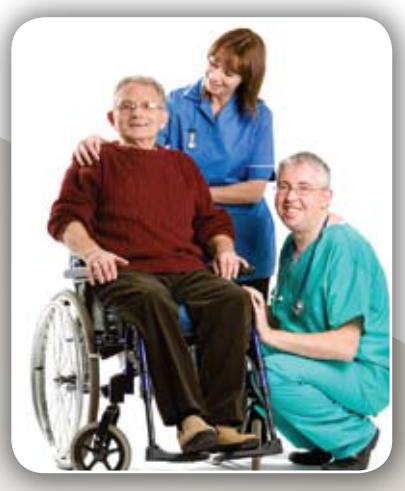
The growth of the estimated $6 billion rehabilitation market is being fueled by the aging baby boomer population, growing numbers of sports and recreation-related injuries, and medical treatments that involve a rehabilitation protocol for the recovery process.

and a large catalog operation. Through acquisitions and internal start-ups, Patterson Medical has established a branch office structure that now consists of 12 branches around the U.S. that share a