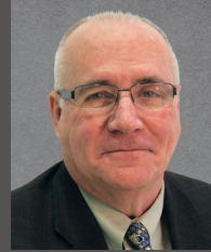
William H. Sheffield