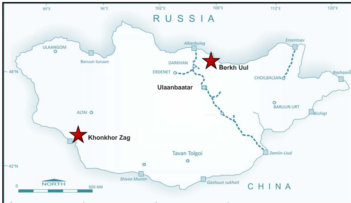
Figure 1: Viking Mines Project Locations, Mongolia

The Khonkhor Zag anthracitic coal project is located on a granted 30 year mining lease close to China's border with only 2 km of the 4 km strike explored by drilling.