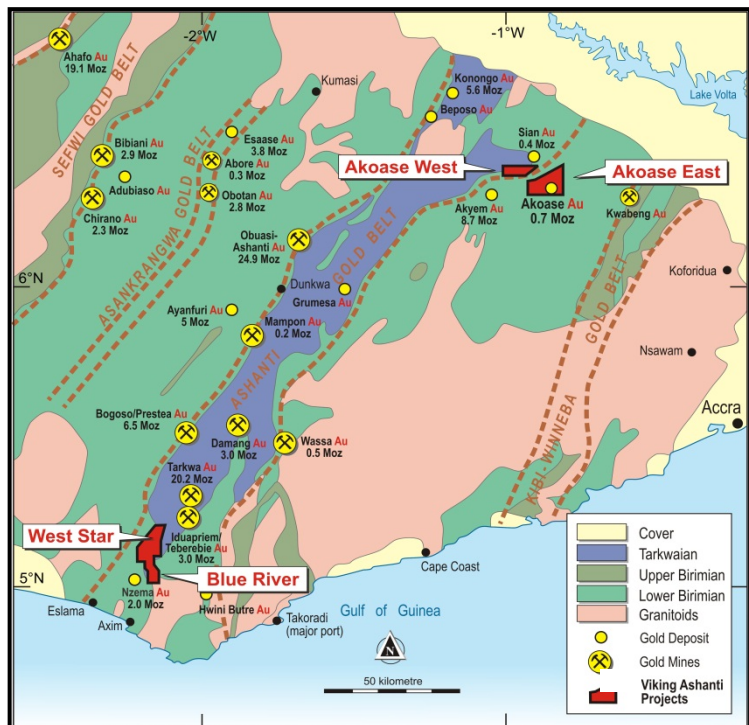
Figure 3: Viking Mines Gold Project Locations, Southern Ghana