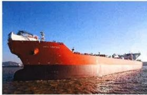
M/T "Anna Knutsen"