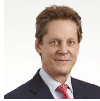
Mr Robert Friedland Co-Chairman

As our shareholders, partners, other stakeholders and followers will know and appreciate, Clean TeQ has achieved headline-making progress in its principal businesses during the past year.