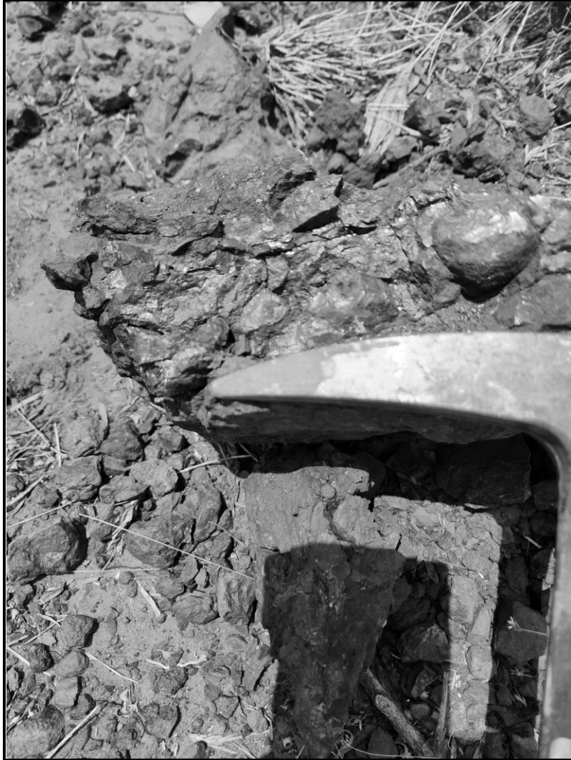
Figure 2: Outcropping ironstone at the Candy Colette Prospect in EL32689, Frewena Frontier

A copy of the Company's Corporate Governance Plan and current Corporate Statement is set out on our website www.incaminerals.com.au/corporate-governance