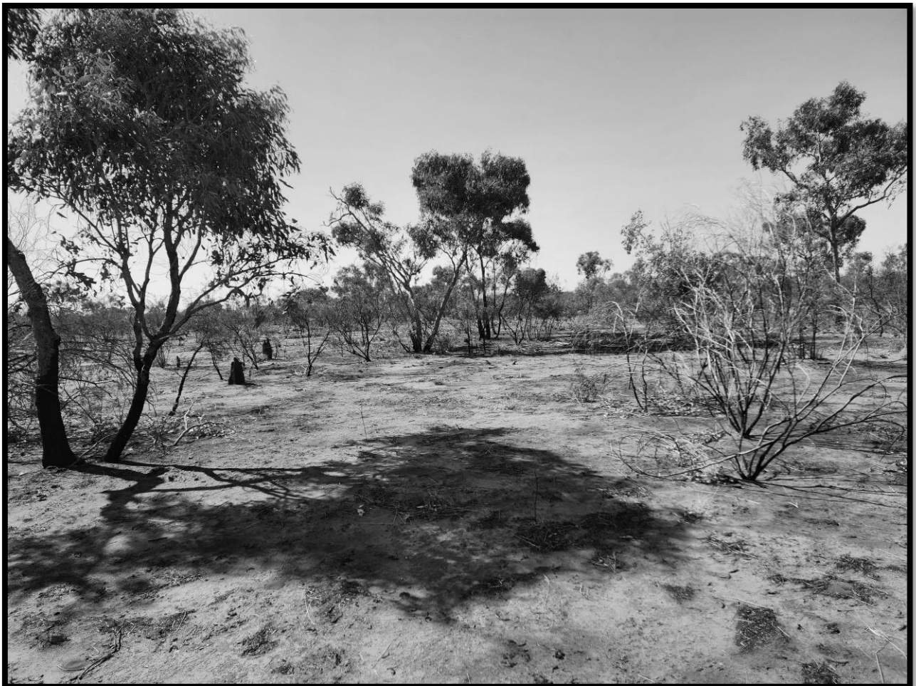
Figure 1: Alpaca Hill Prospect in EL31974, Frewena Fable

Stantons Level 2, 40 Kings Park Road West Perth WA 6005