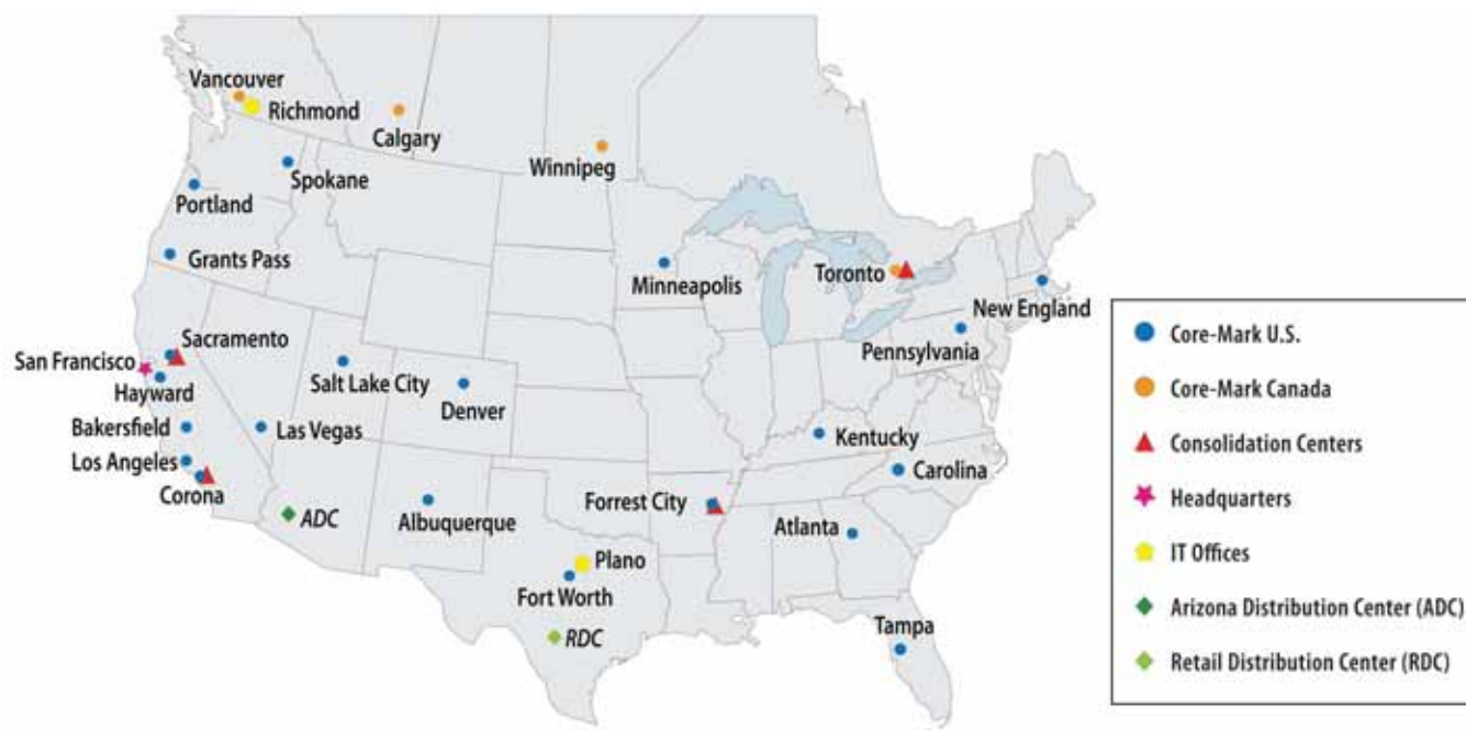
Map of Operations

We operate four consolidation centers, including one that opened in Toronto, Canada in the fourth quarter of 2013, which buy products from our suppliers in bulk quantities and then distribute the products to many of our other distribution centers. The products purchased by our consolidation centers include frozen and chilled items, health and beauty care and general merchandise products. The new center in Toronto was launched with an exclusive distribution arrangement with a retail beverage manufacturer. We expect to obtain additional consolidated purchasing opportunities for Canada in 2014. We operate two additional facilities as a third party logistics provider. One distribution facility located in Phoenix, Arizona, referred to as the Arizona Distribution Center (“ADC”), is dedicated solely to supporting the logistics and management requirements of one of our major customers, Couche-Tard. The second distribution facility located in San Antonio, Texas, referred to as the Retail Distribution Center (“RDC”), is dedicated solely to supporting another major customer, CST Brands, Inc. (formerly, Valero Energy Corporation).