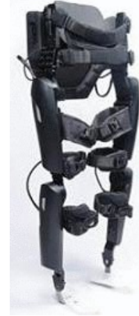
ReWalk Personal 6.0

Additionally, we have received regulatory approval to sell the ReWalk device in other countries. In the future we intend to seek approval from the applicable regulatory agencies in other jurisdictions where we may seek to market ReWalk.