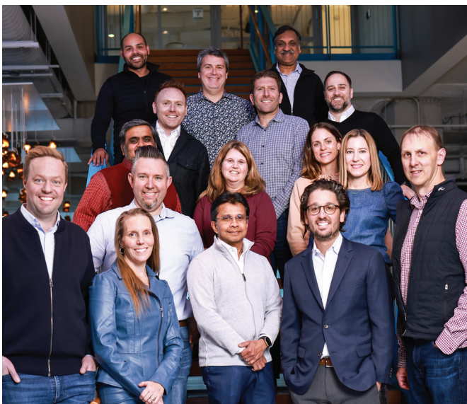
2U Operating Team