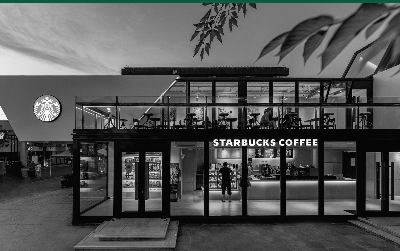
Starbucks Shanghai Container Store