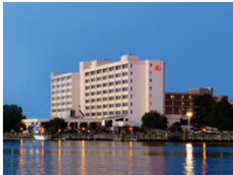
Hilton Wilmington Riverside Wilmington, NC