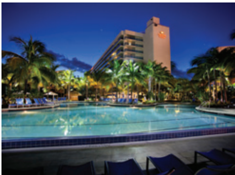
DoubleTree Resort by Hilton Hollywood Beach Hollywood, FL