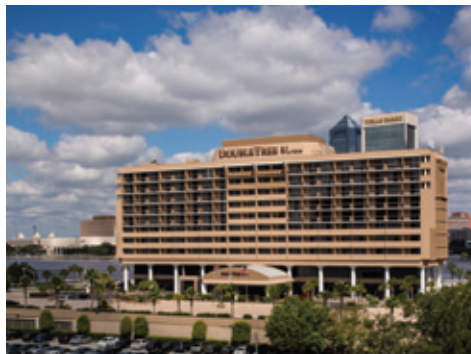
DoubleTree by Hilton Jacksonville Riverfront Jacksonville, FL