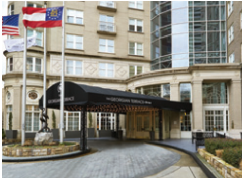
The Georgian Terrace by Sotherly Atlanta, GA