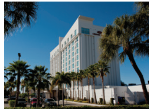
Crowne Plaza Tampa Westshore Tampa, FL