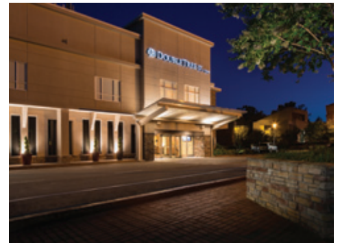
DoubleTree by Hilton Brownstone University Raleigh, NC