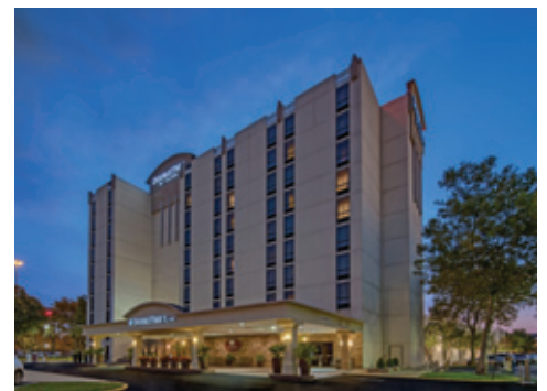
DoubleTree by Hilton Philadelphia Airport Philadelphia, PA