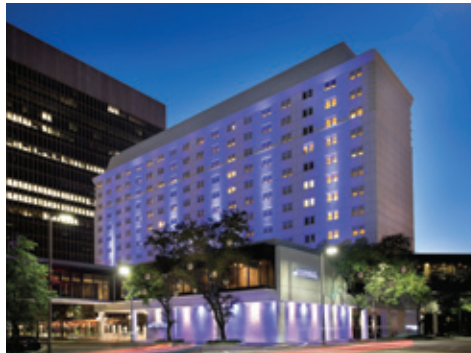
The Whitehall by Sotherly Houston, TX