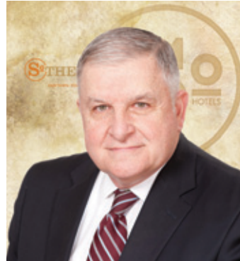
General Anthony C. Zinni (USMC Ret.) Director