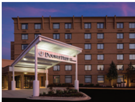
DoubleTree by Hilton Laurel Laurel, MD