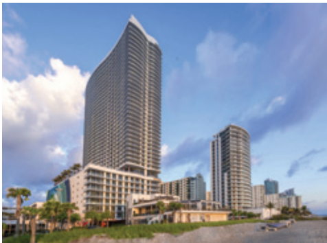
Hyde Resort & Residences Hollywood, FL