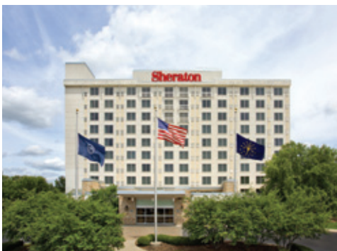
Sheraton Louisville Riverside Jeffersonville, IN