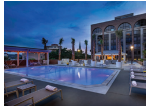
The Desoto by Sotherly Savannah, GA