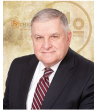
Gen. Anthony C. Zinni (USMC Retired) Director