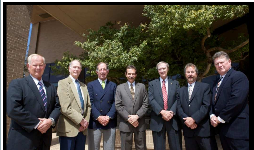
NGS Board of Directors from left to right: