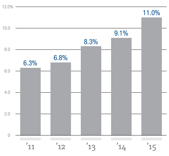
(1) Segment Operating Margin was adjusted in 2011, 2014 and 2015 to exclude goodwill impairment charges of $290 million, $47 million and $73 million, respectively, and adjusted in 2015 to also exclude a purchased intangibles impairment charge of $27 million. Including the goodwill and purchased intangibles impairment charges, the segment operating margin would have been 1.9% in 2011, 8.4% in 2014 and 9.5% in 2015.