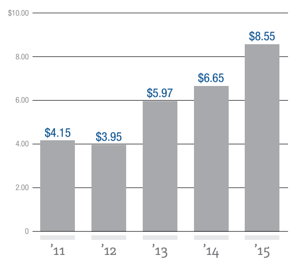
(1) Adjusted Diluted EPS is a non-GAAP financial metric that excludes the tax effected goodwill and purchased intangibles impairment charges and FAS/CAS Adjustment. Please see the page that precedes the back cover of this report for information on excluded items and a reconciliation of these measures to GAAP.